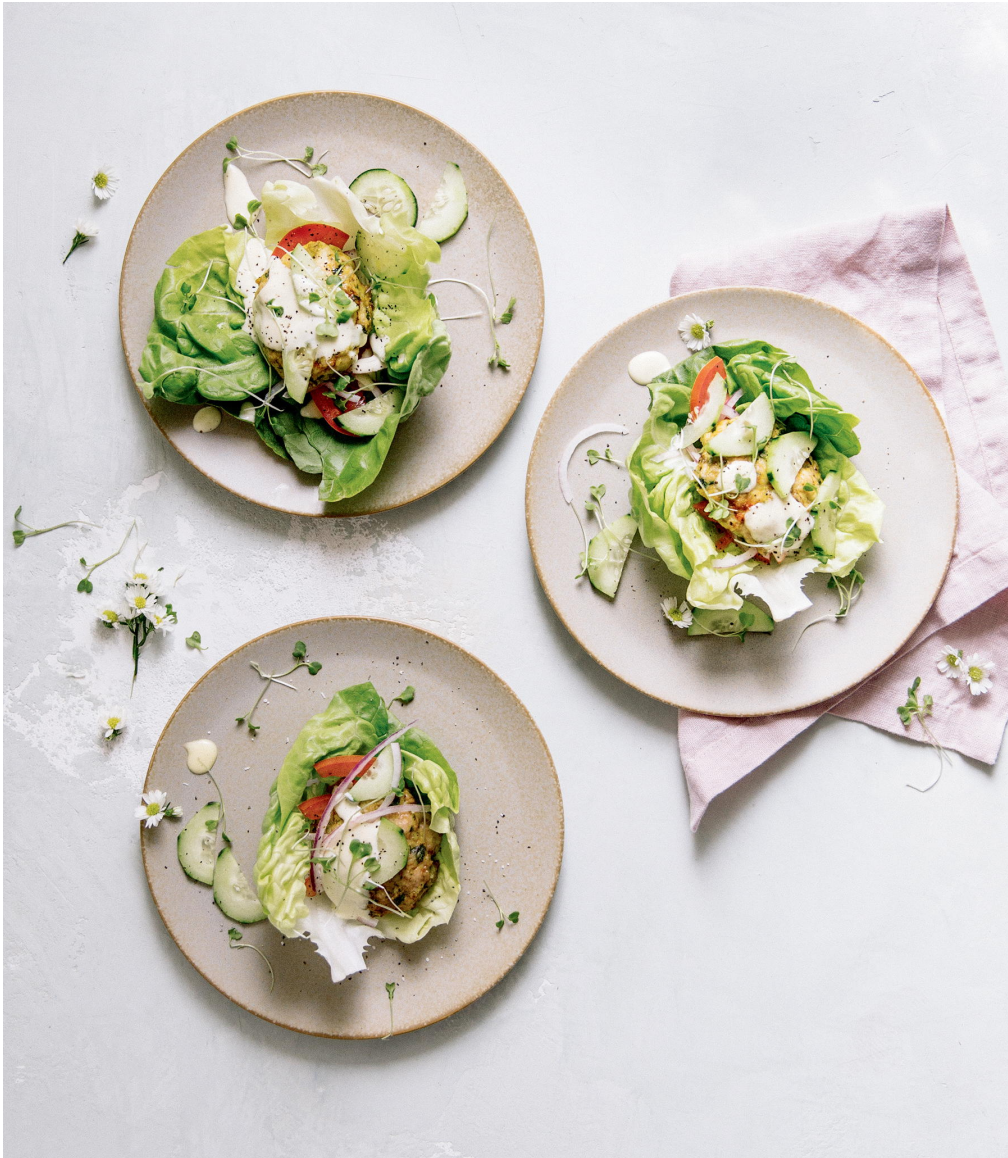
Oven-Baked Chicken Kofta Wraps