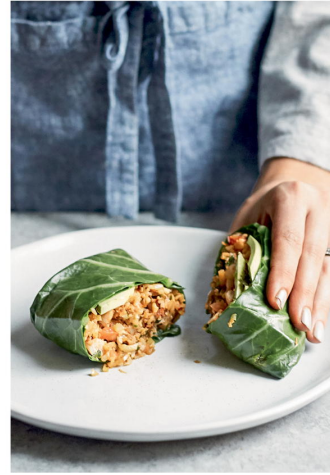
Collard Green and Chicken Burritos