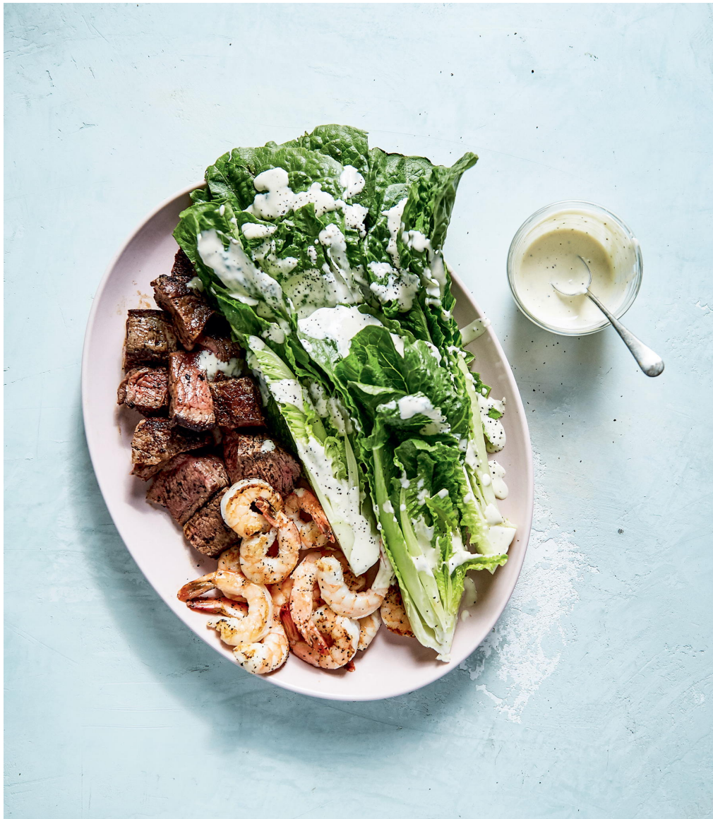
Steak House Caesar Salad