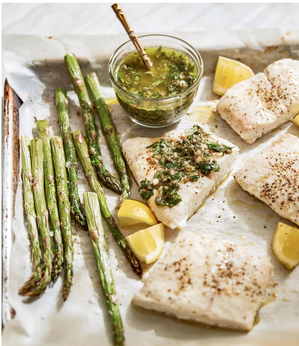
Sheet Pan Halibut with Italian Salsa Verde and Asparagus