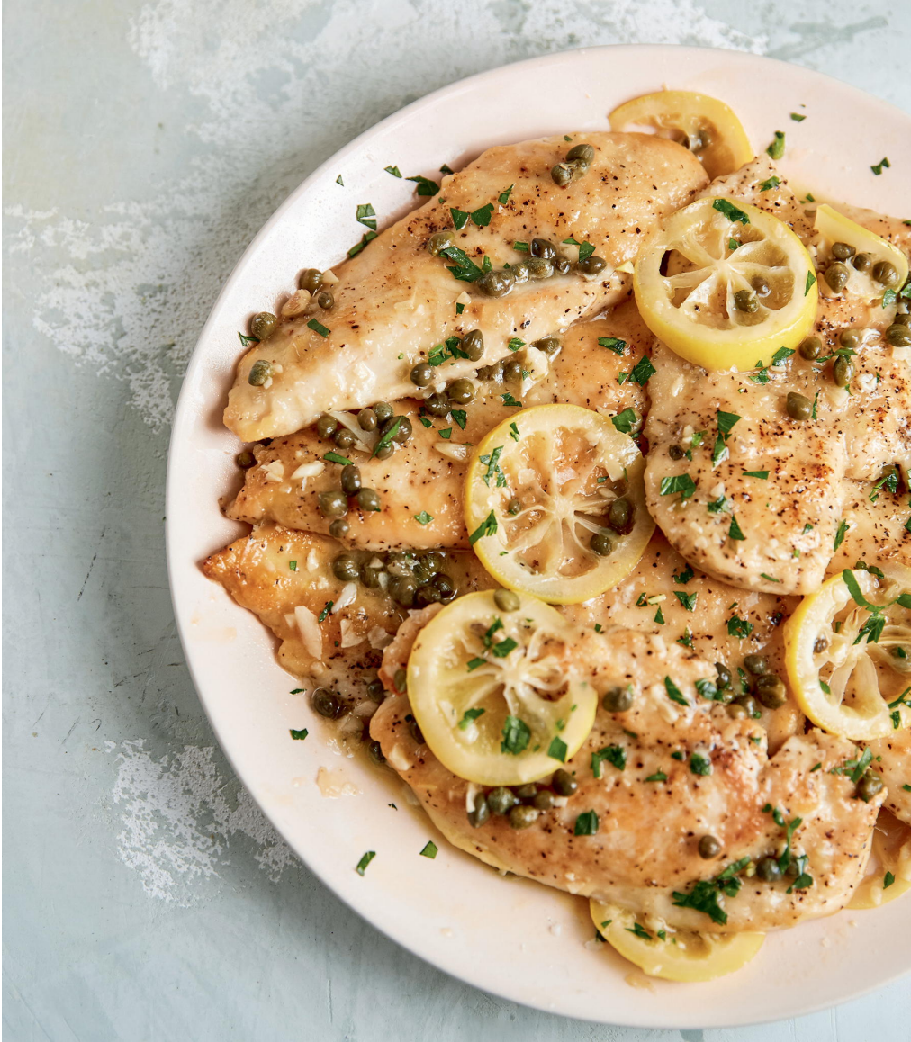
Skillet Chicken Piccata