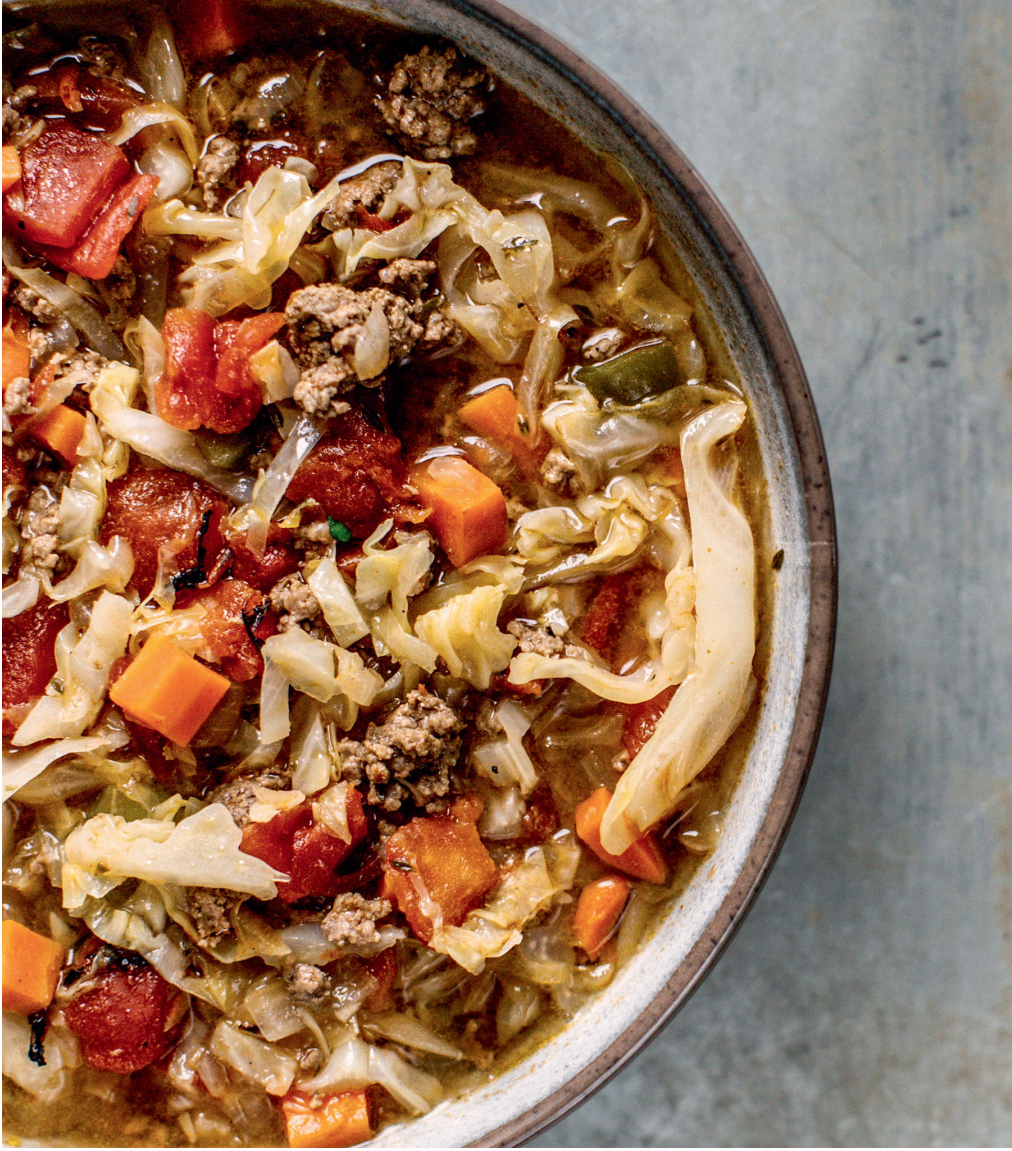
Mexican Cabbage Soup