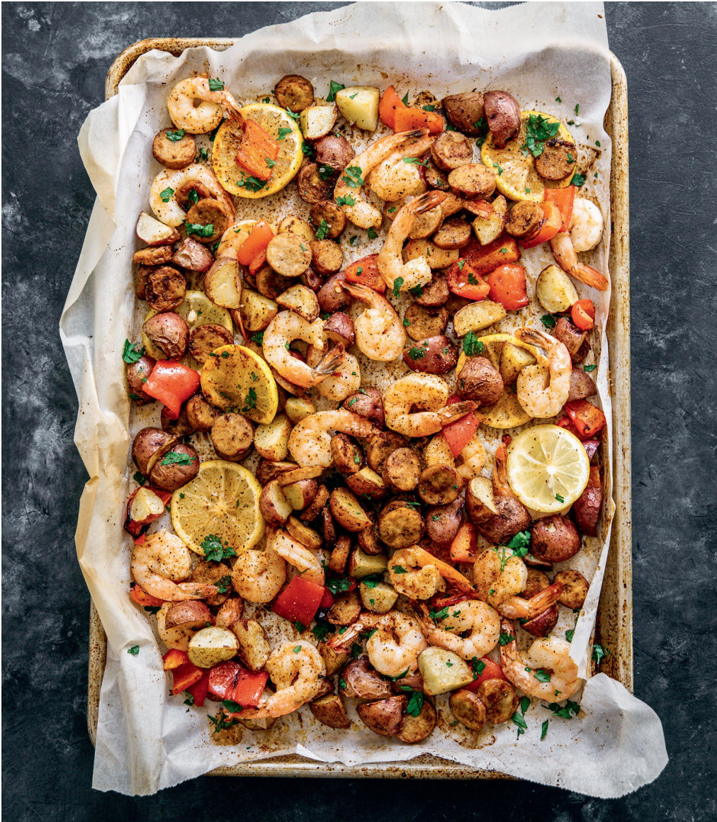
Cajun Sheet-Pan Shrimp "Boil"