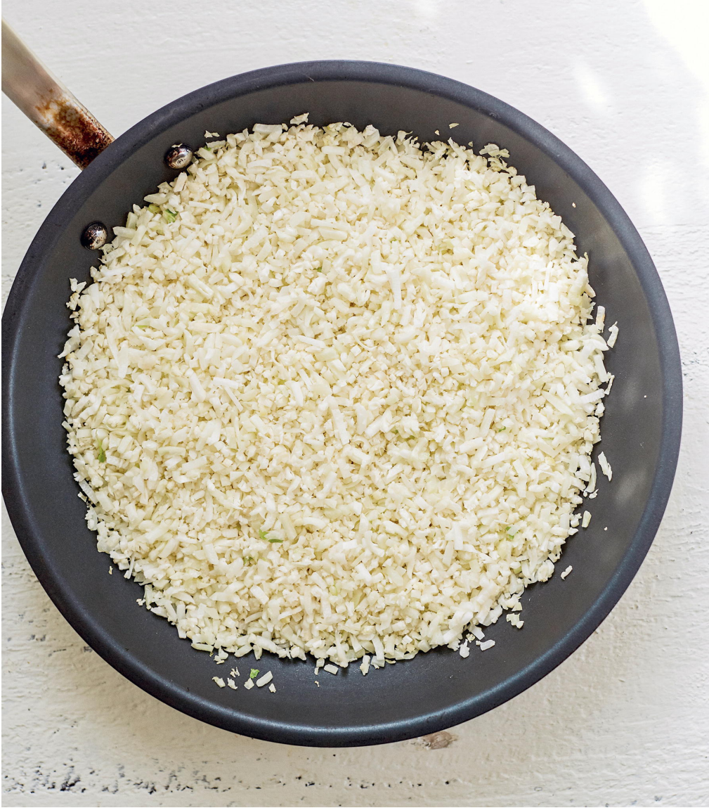
Prepared Cauliflower Rice