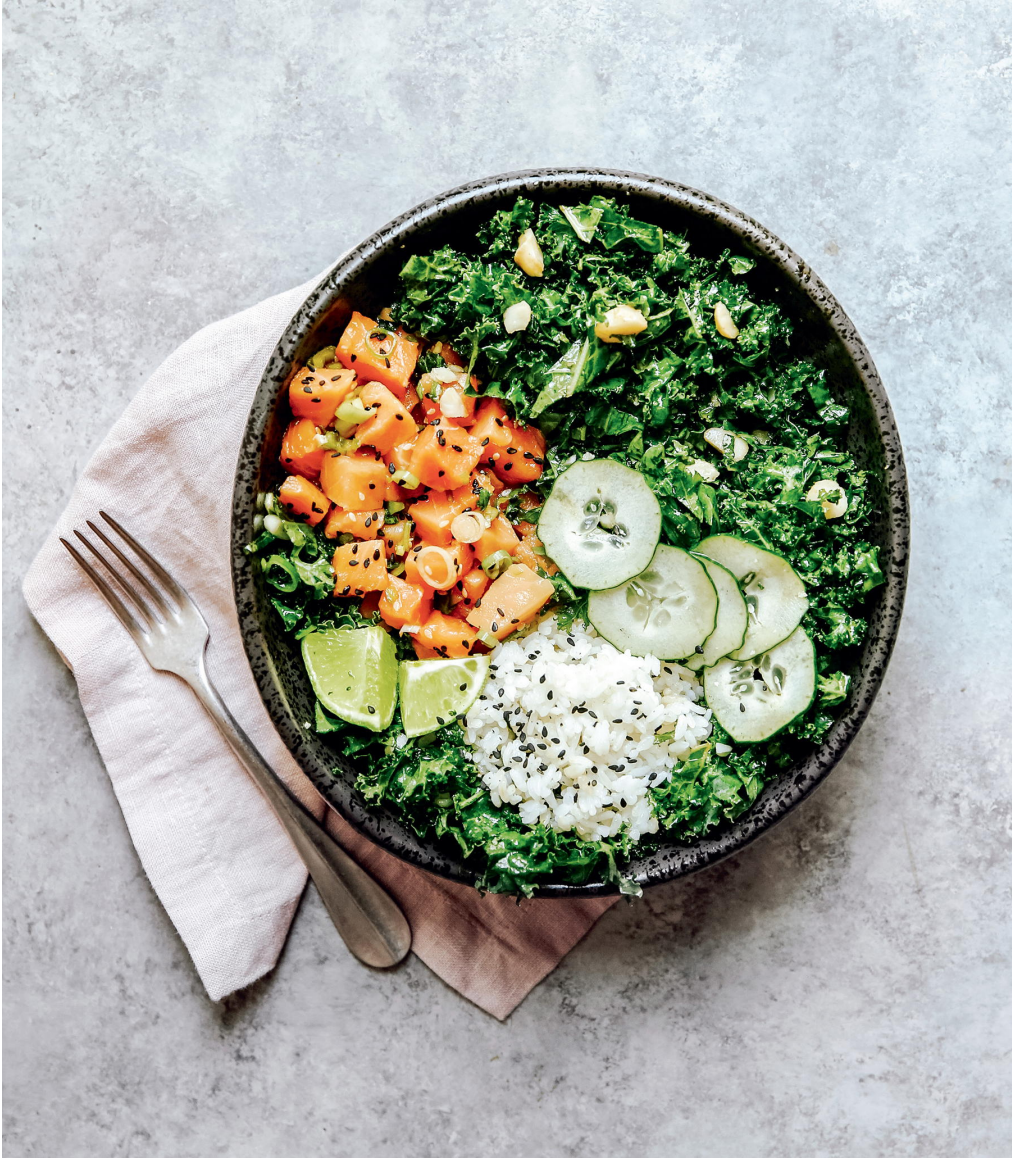
Salmon Poke and Kale Salad Bowls