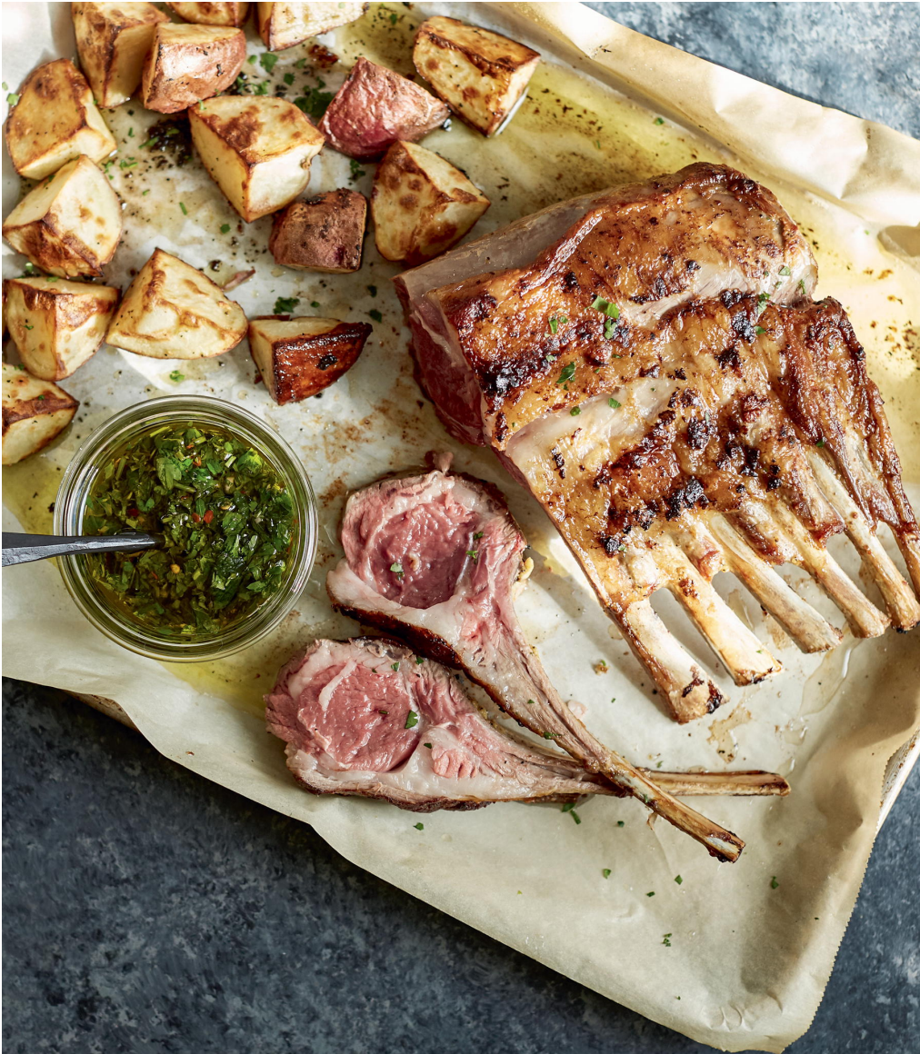
Sheet Pan Rack of Lamb with Potatoes and Mint Chimichurri