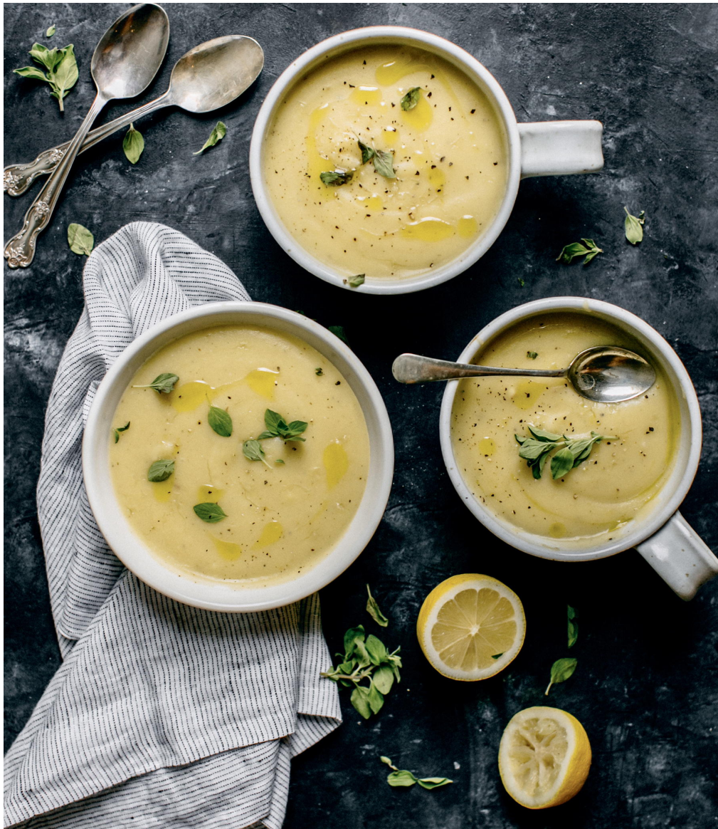
Greek Lemon and Oregano Potato Soup