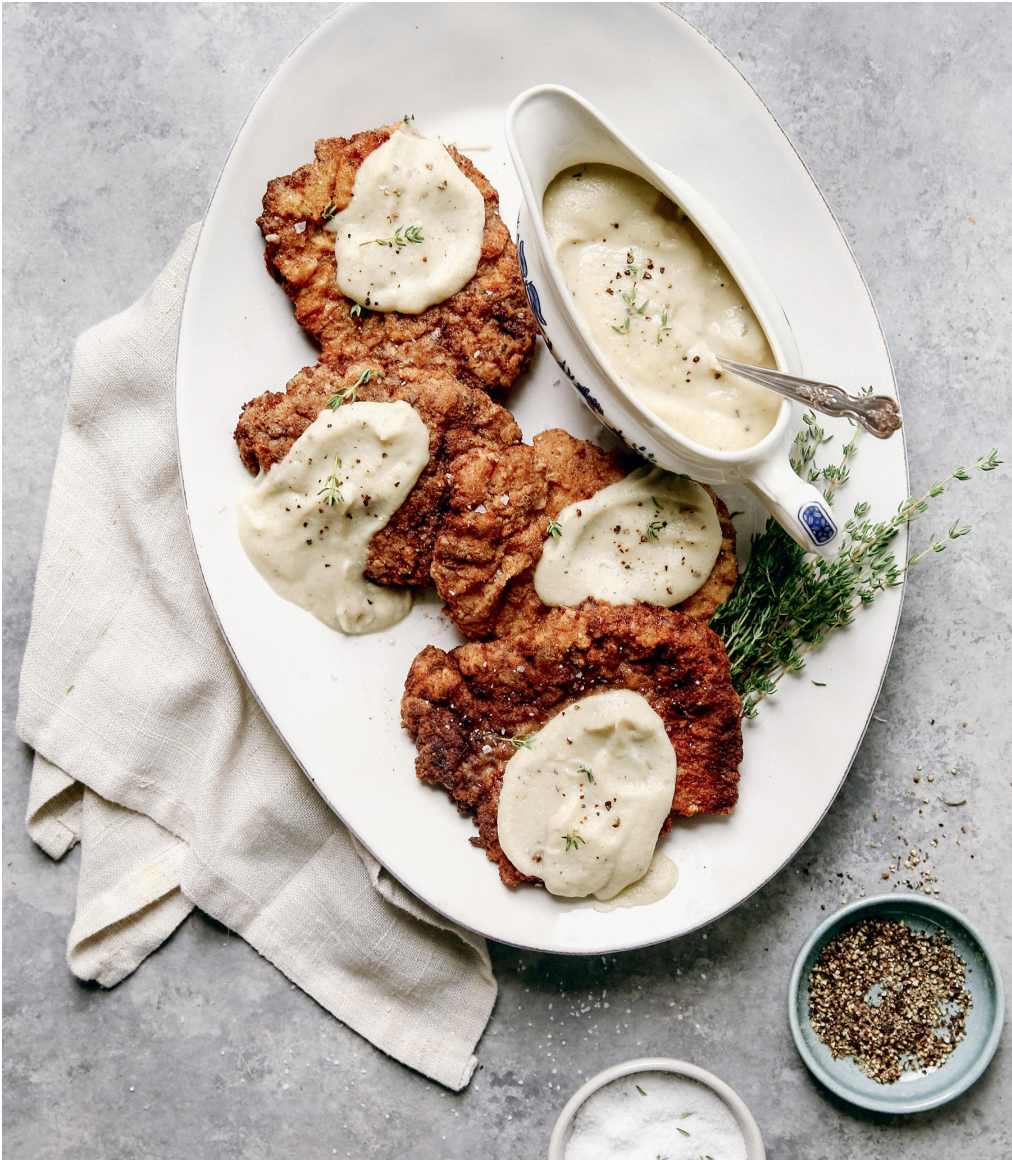
Chicken-Fried Steak with Creamy Cauliflower Gravy