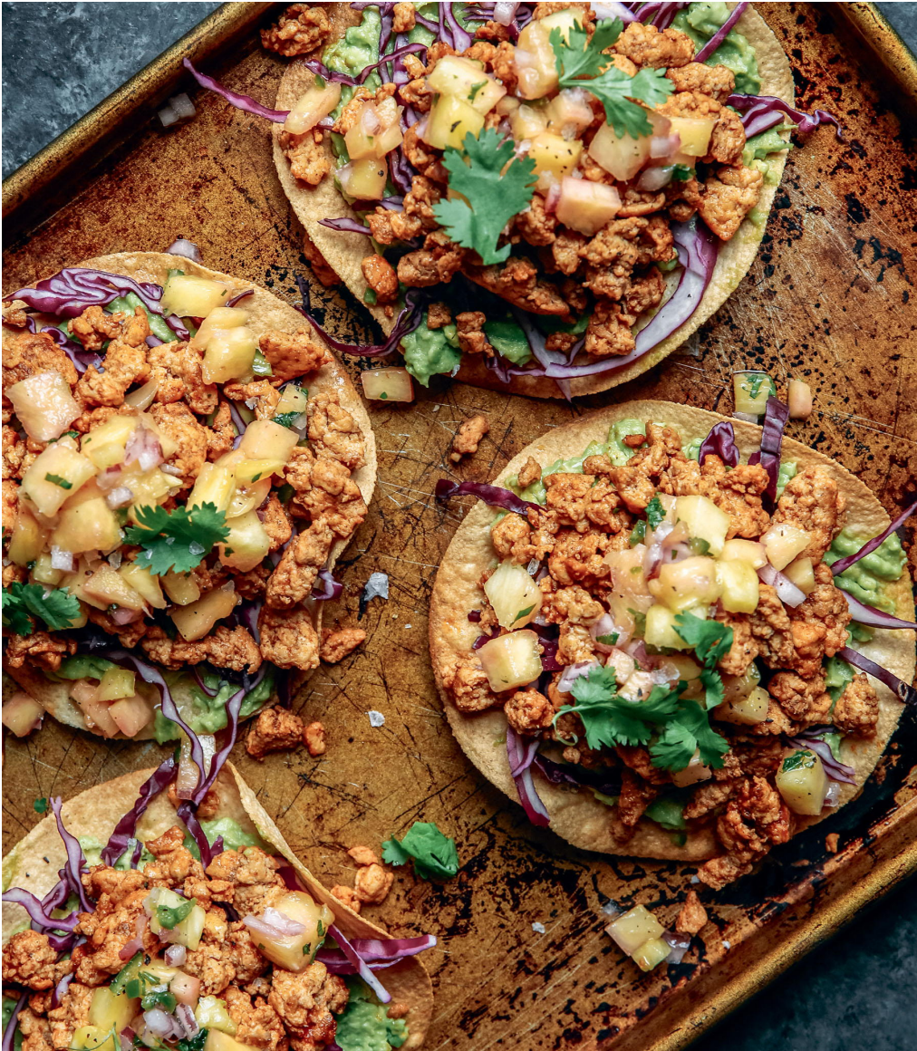
Chipotle Chicken Tostadas with Pineapple Salsa