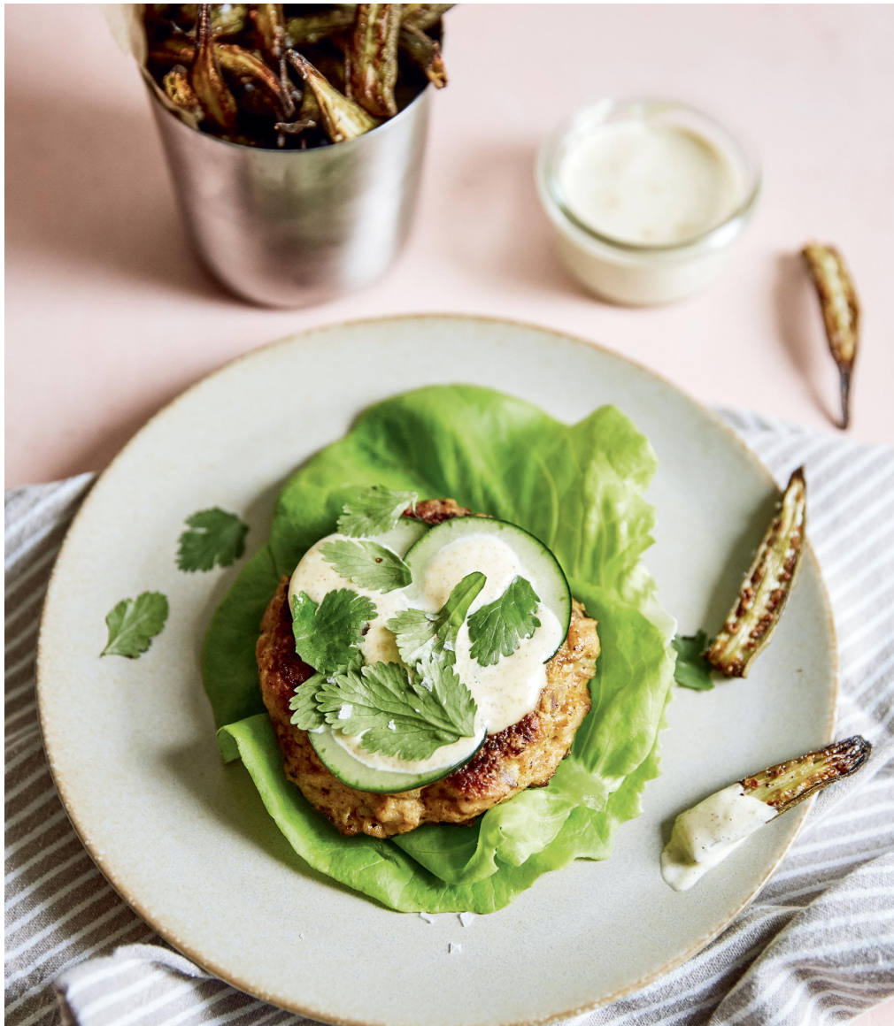
Tandoori Chicken Burgers with Cumin Aioli and Crispy Okra Fries