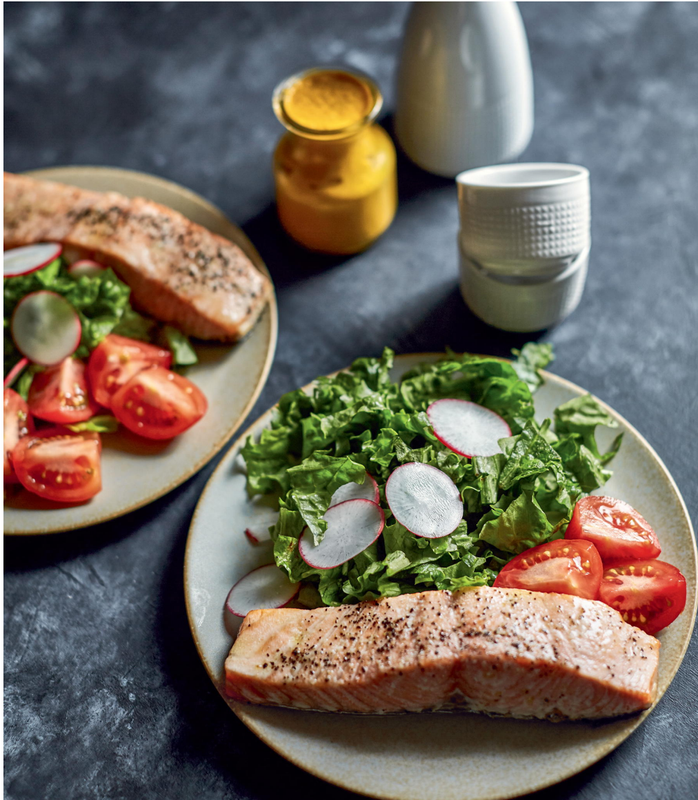
Carrot-Ginger Salad with Baked Salmon