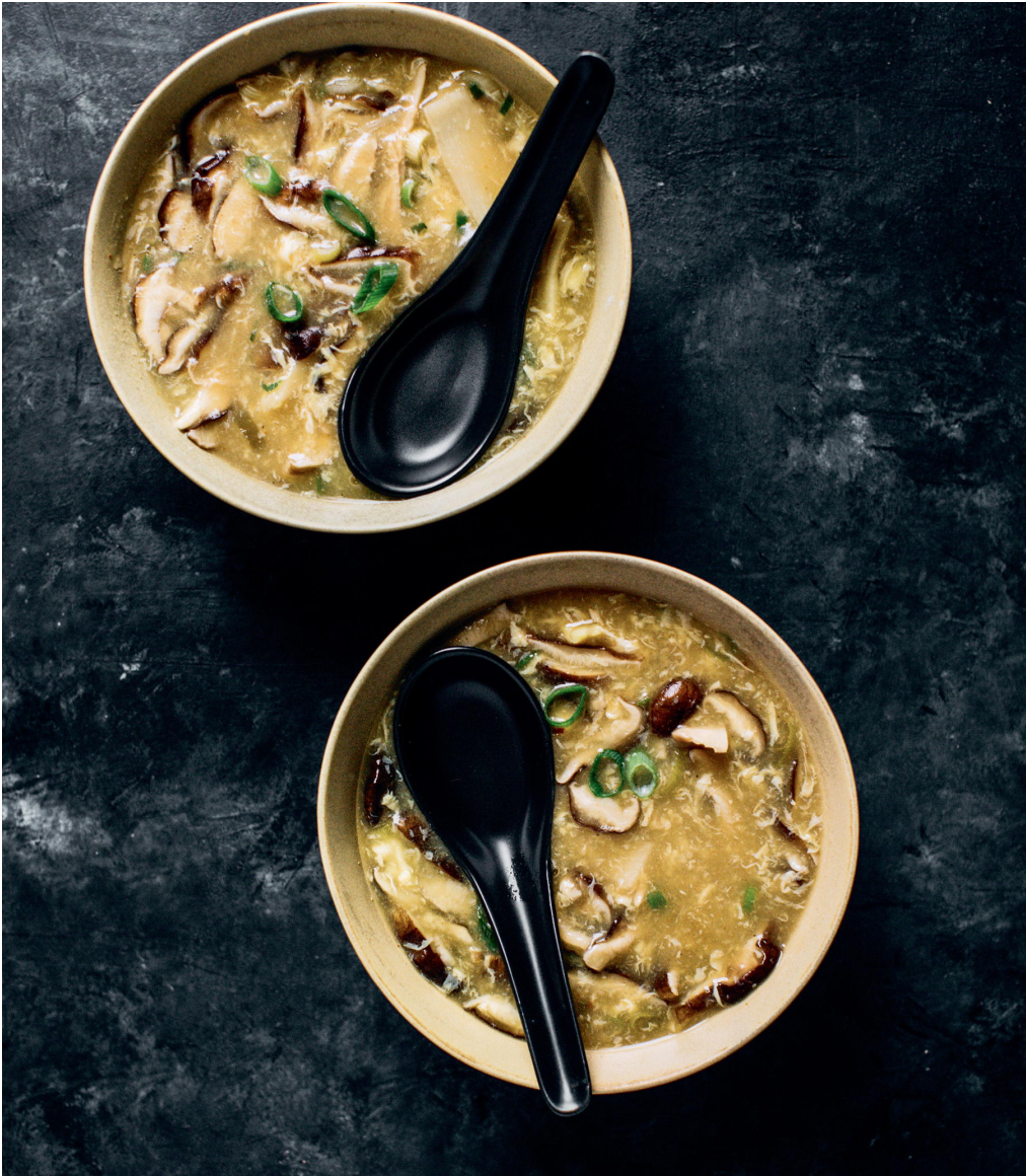
Whole30 Hot-and-Sour Soup