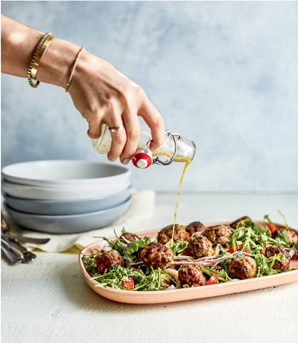
Greek Salad with Lamb Meatballs