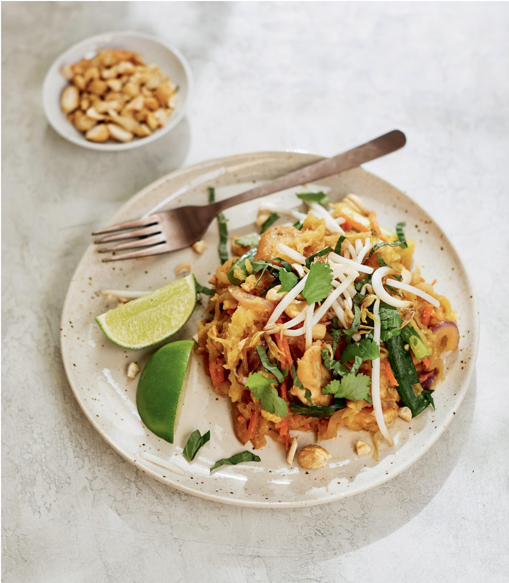
Spaghetti Squash Pad Thai