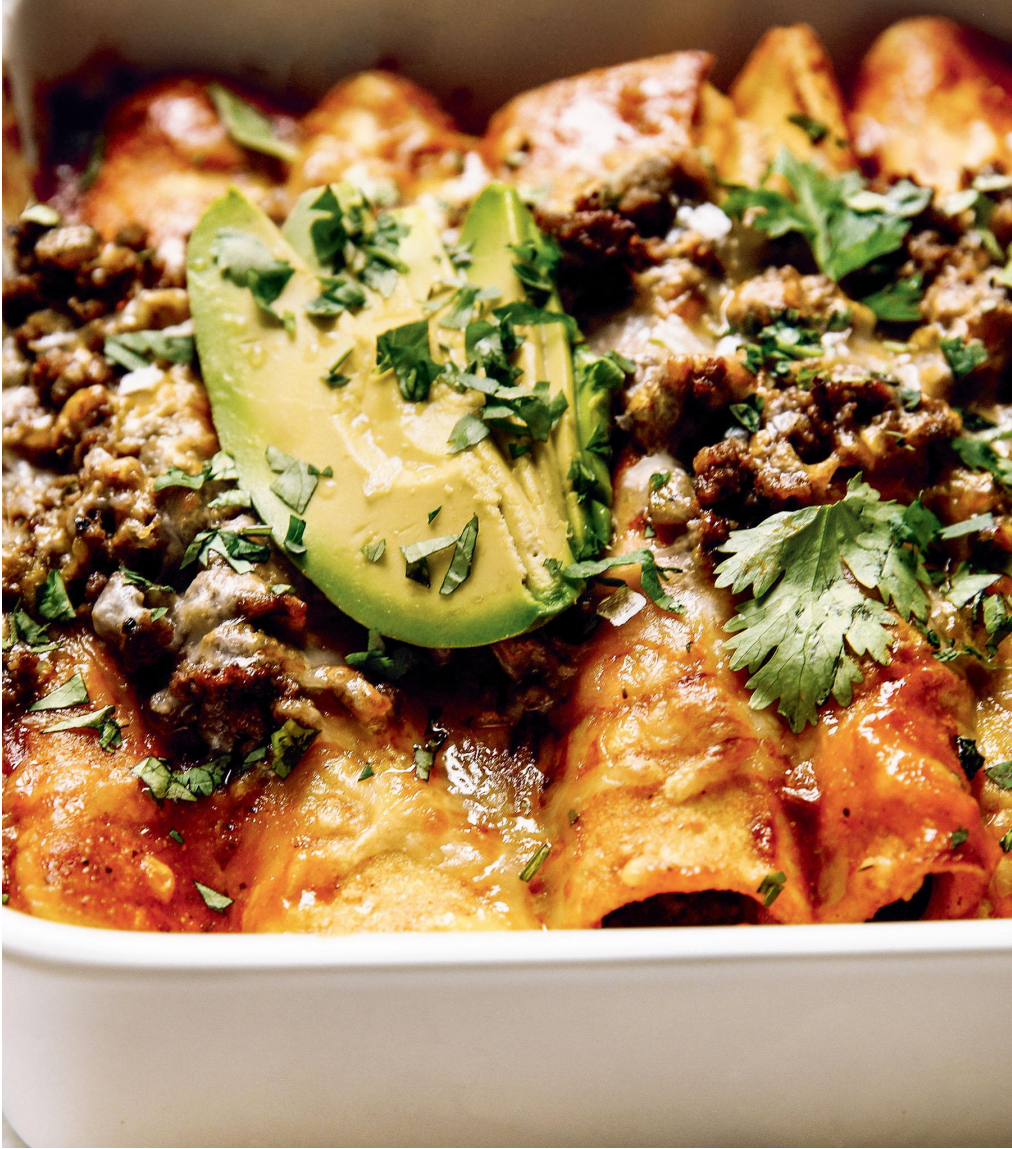
Enchiladas con Carne