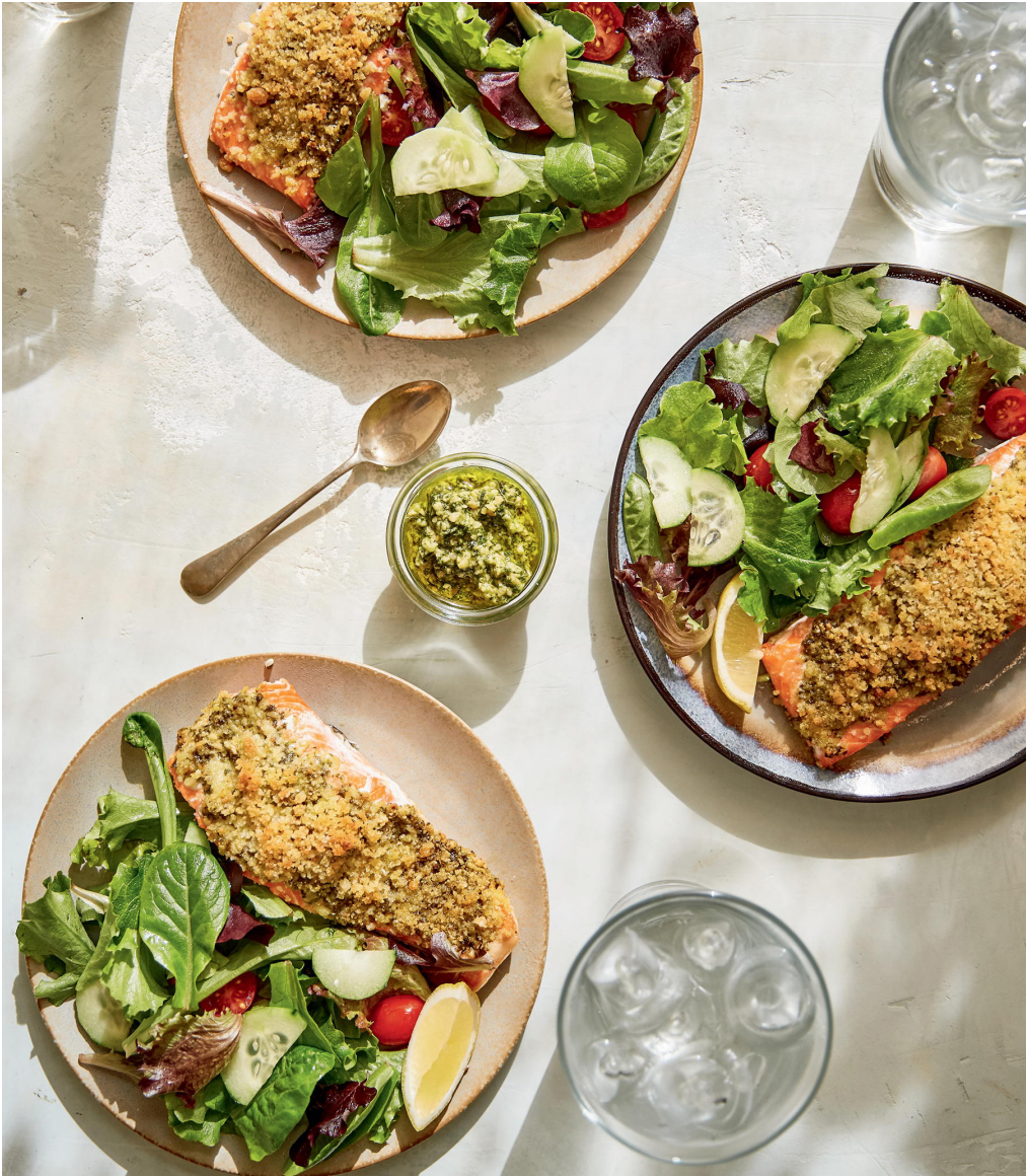
Salmon Milano with Lemon-Basil Pesto