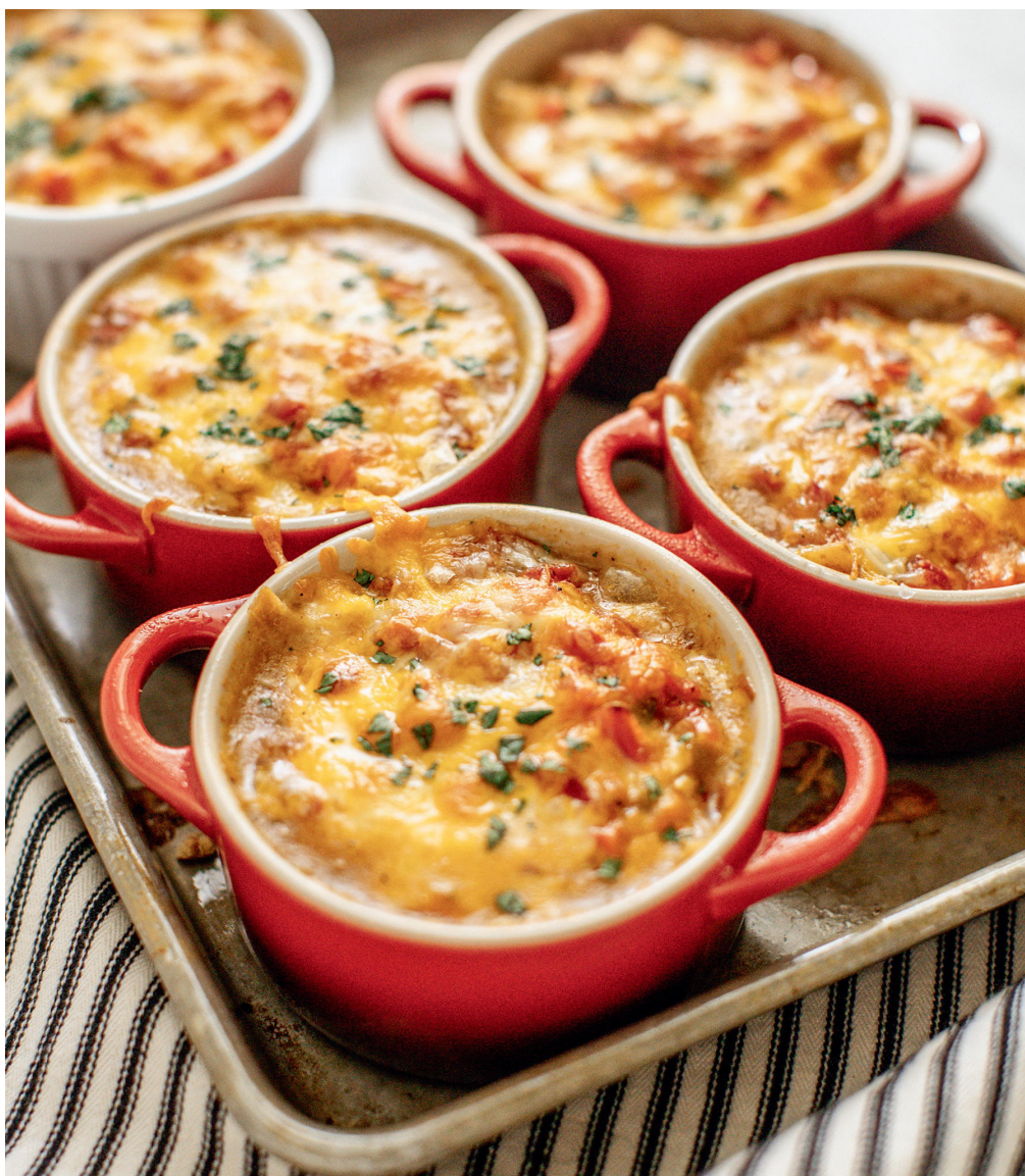
Mini King Ranch Casseroles