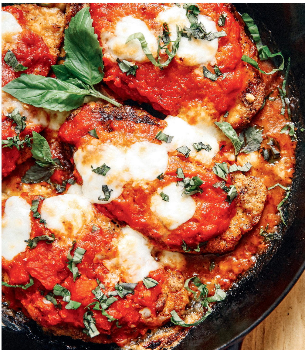
The Best Grain-Free Chicken No-Parmesan