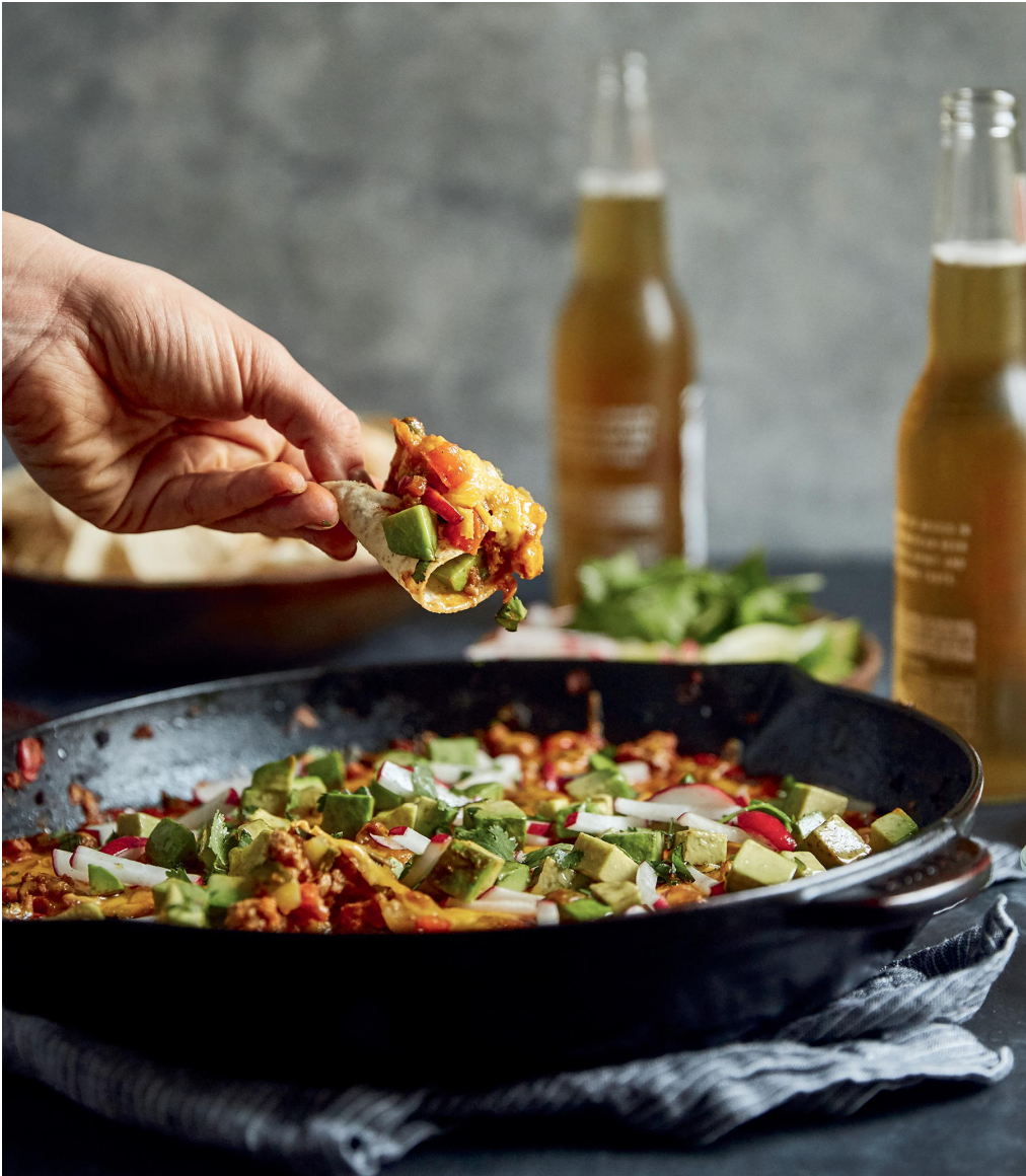
Turkey Taco Skillet Bake