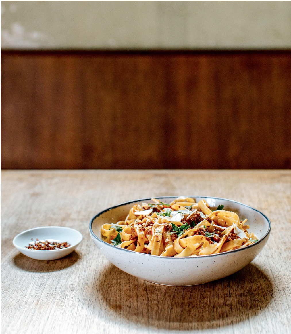
Weeknight Lamb Bolognese