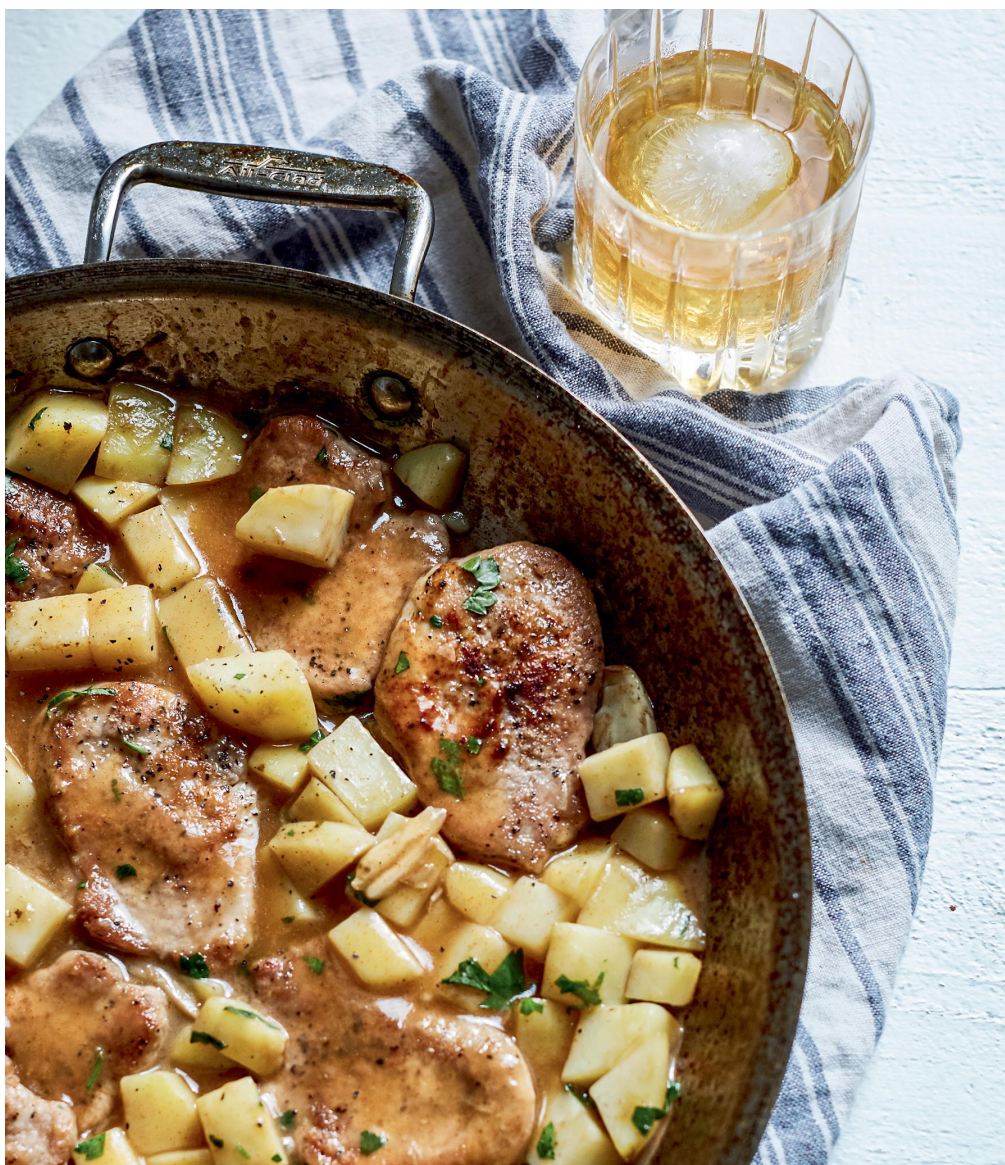
Solomillo al Whisky.