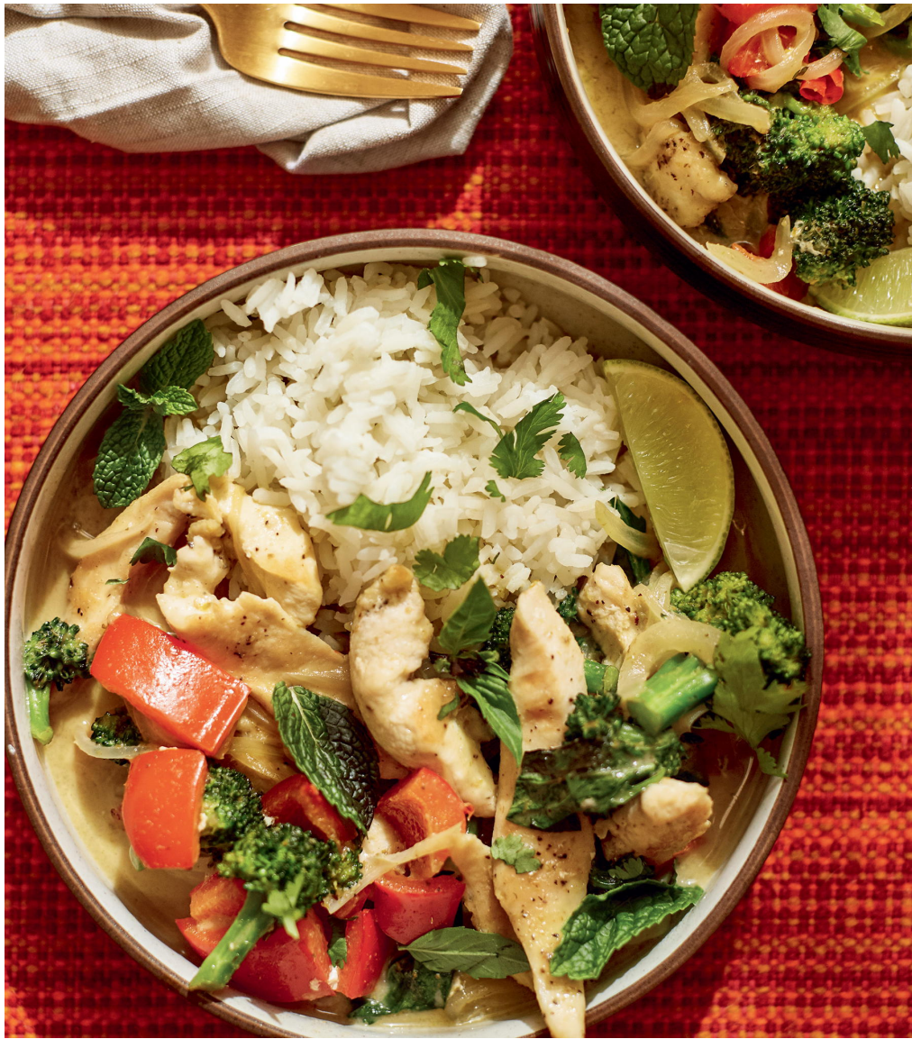
Green Curry Chicken