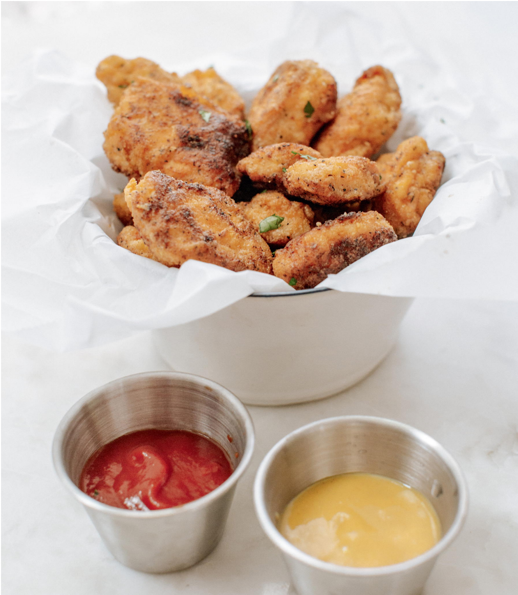
The Best Grain-Free Chicken Nuggets