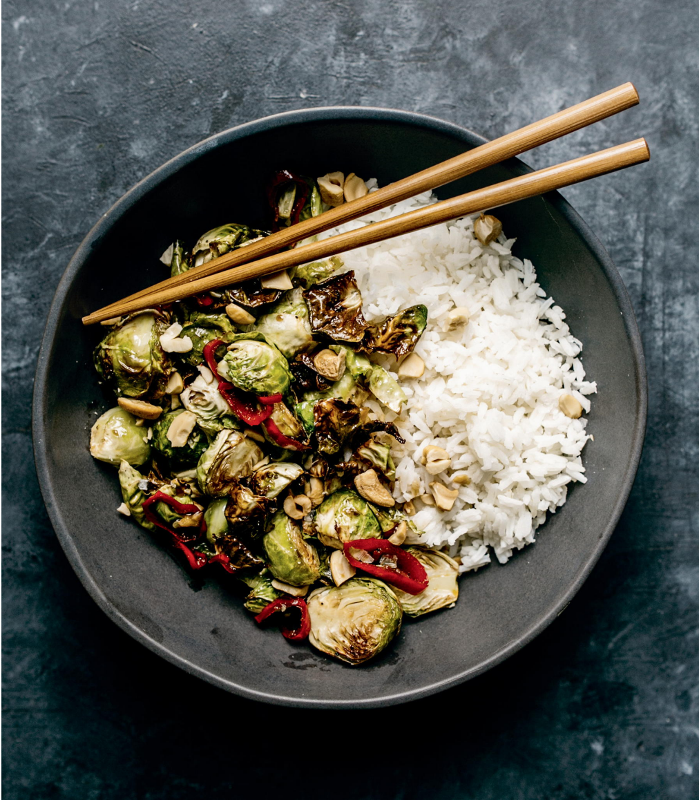
Kung Pao Brussels Sprouts