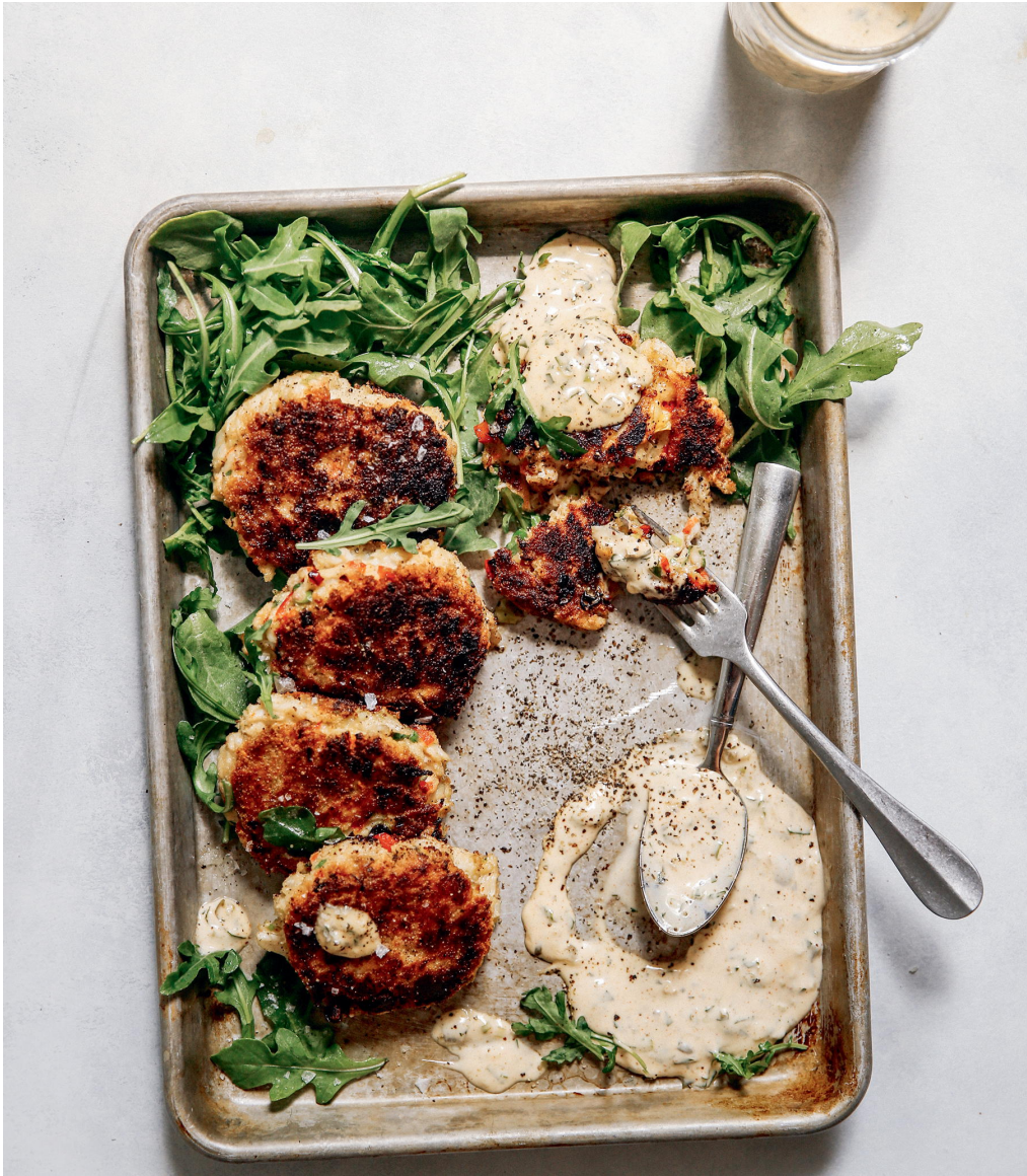
Cajun Crab Cakes with Remoulade