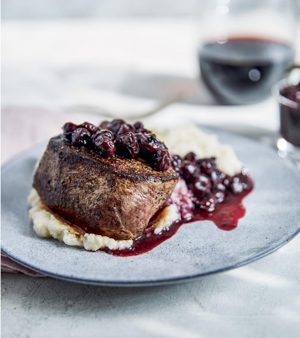
Blueberry Filet Mignon with Cauliflower Mash