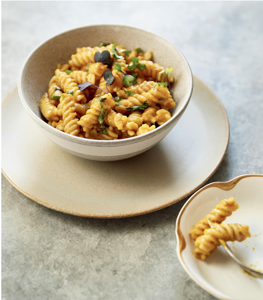
One-Pot Coconut Curry Butternut Squash Pasta