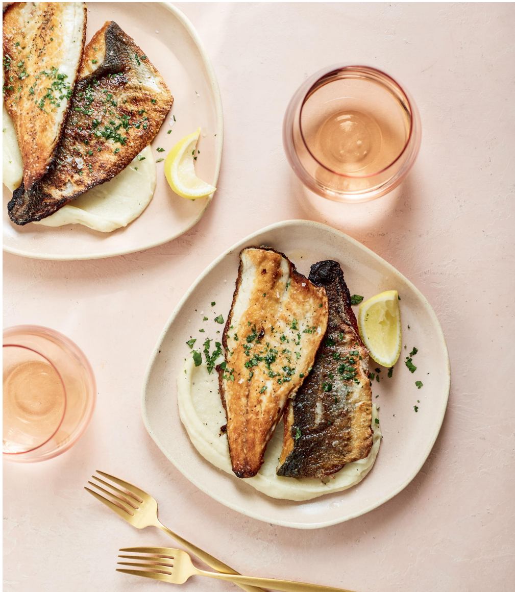
Crispy-Skinned Branzino with Parsnip Puree