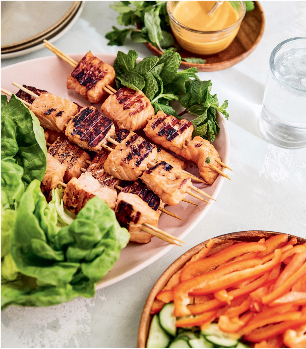
Salmon Satay Lettuce Cups