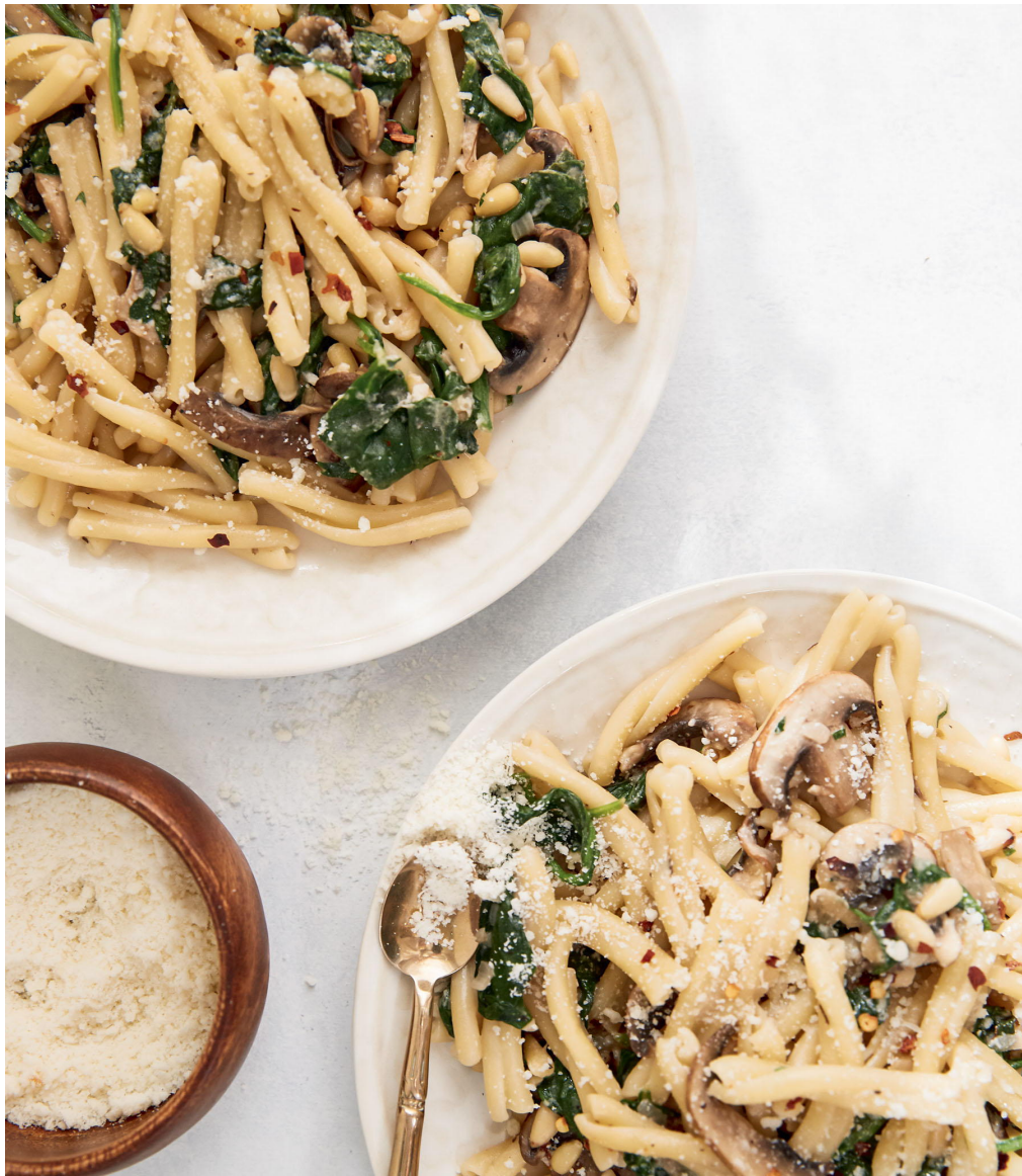
Strozzapreti Pasta with Spinach, Mushrooms, and Toasted Pine Nuts