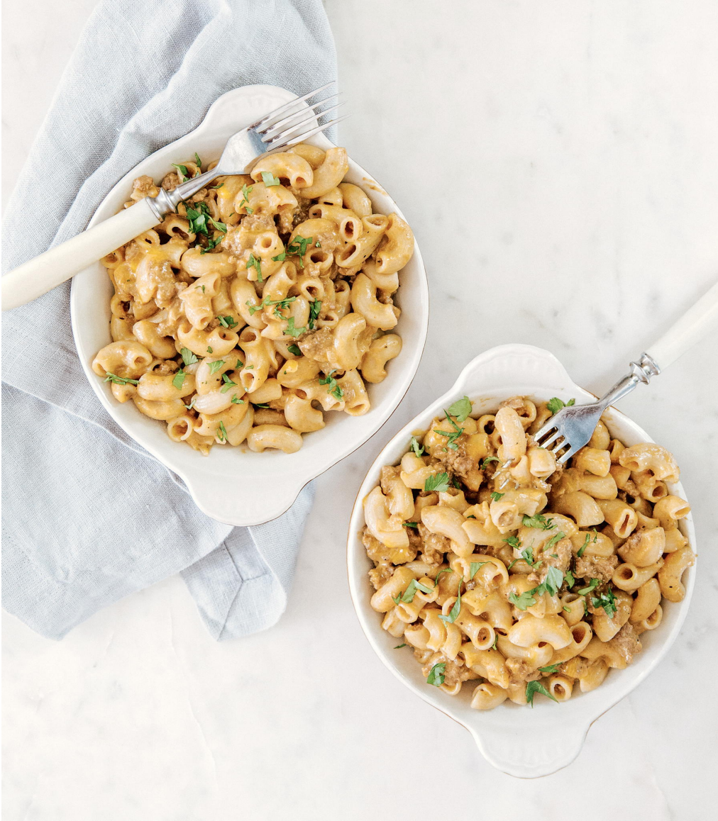
One-Pot Hamburger Helper