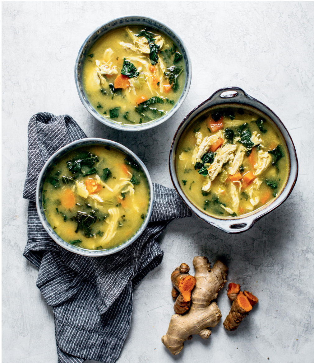
Healing Chicken Soup