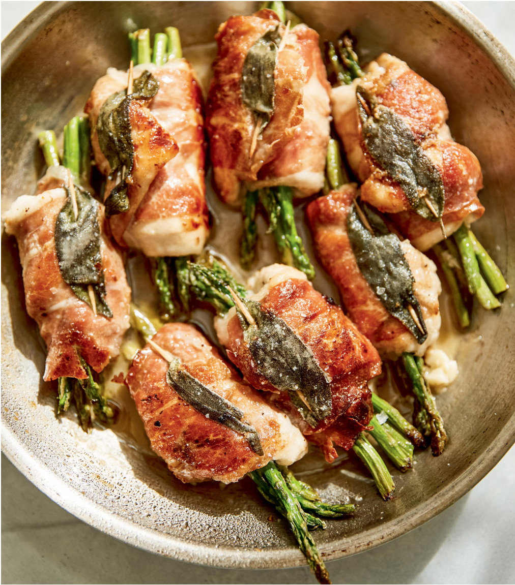
Chicken Saltimbocca Roll-Ups