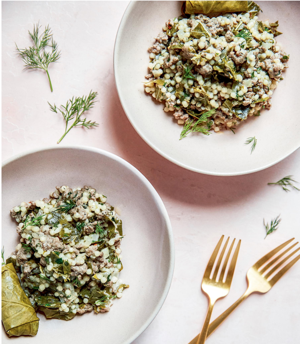
One-Pot Unstuffed Grape Leaves