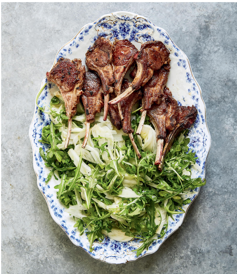
Garam Masala-Rubbed Lamb Chops with a Simple Fennel and Arugula Salad