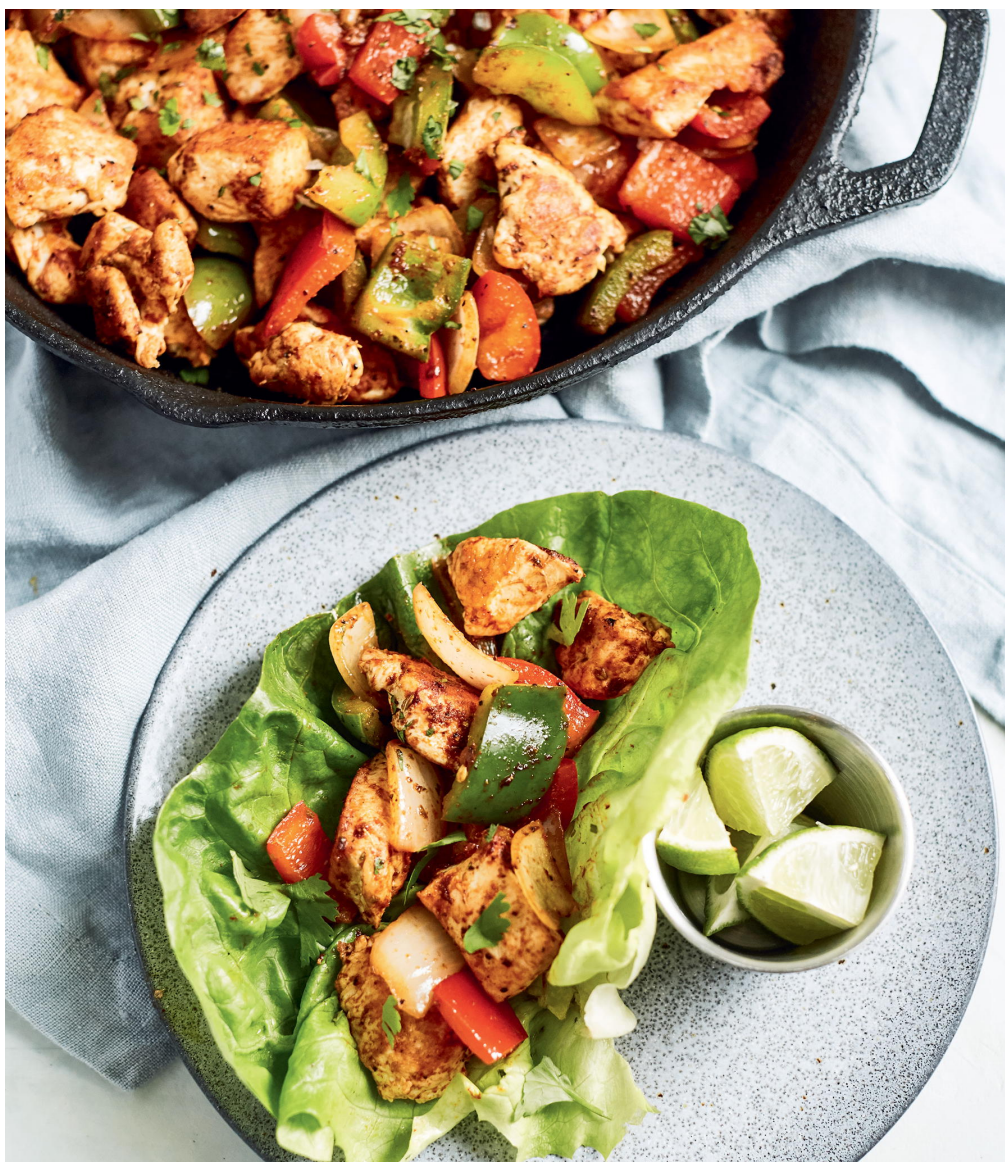
Chicken Fajita Lettuce Cups