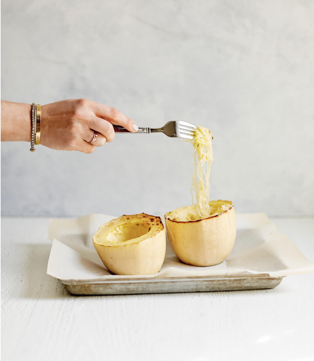
Roasted Spaghetti Squash