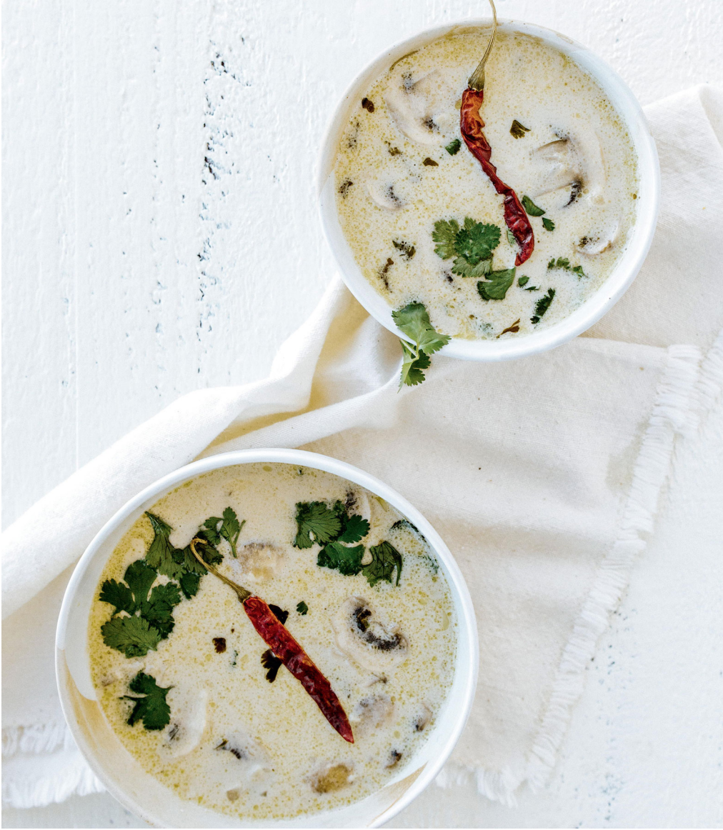
Tom Kha Gai Soup