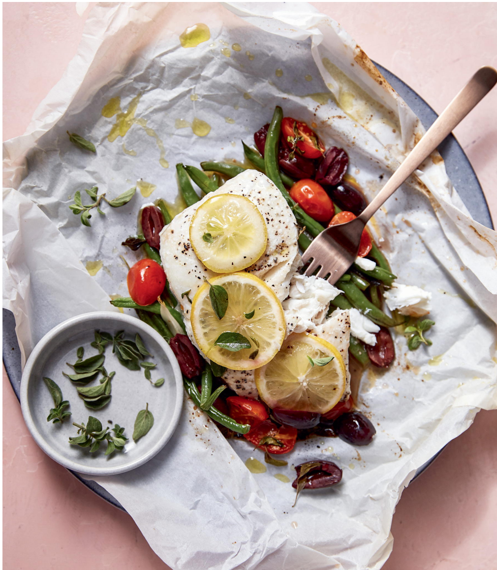
Mediterranean Fish en Papillôte