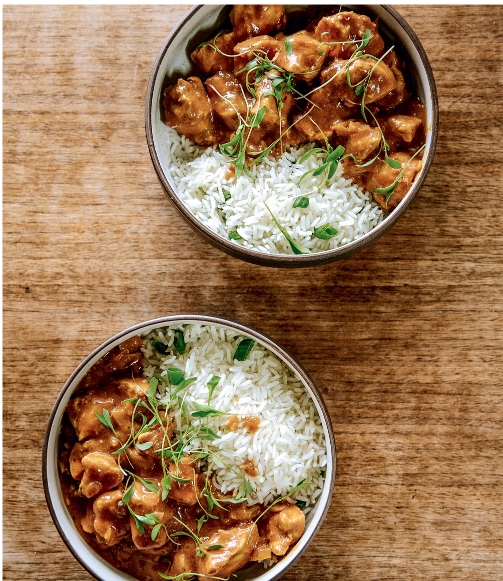
Slow Cooker Chicken Tikka Masala