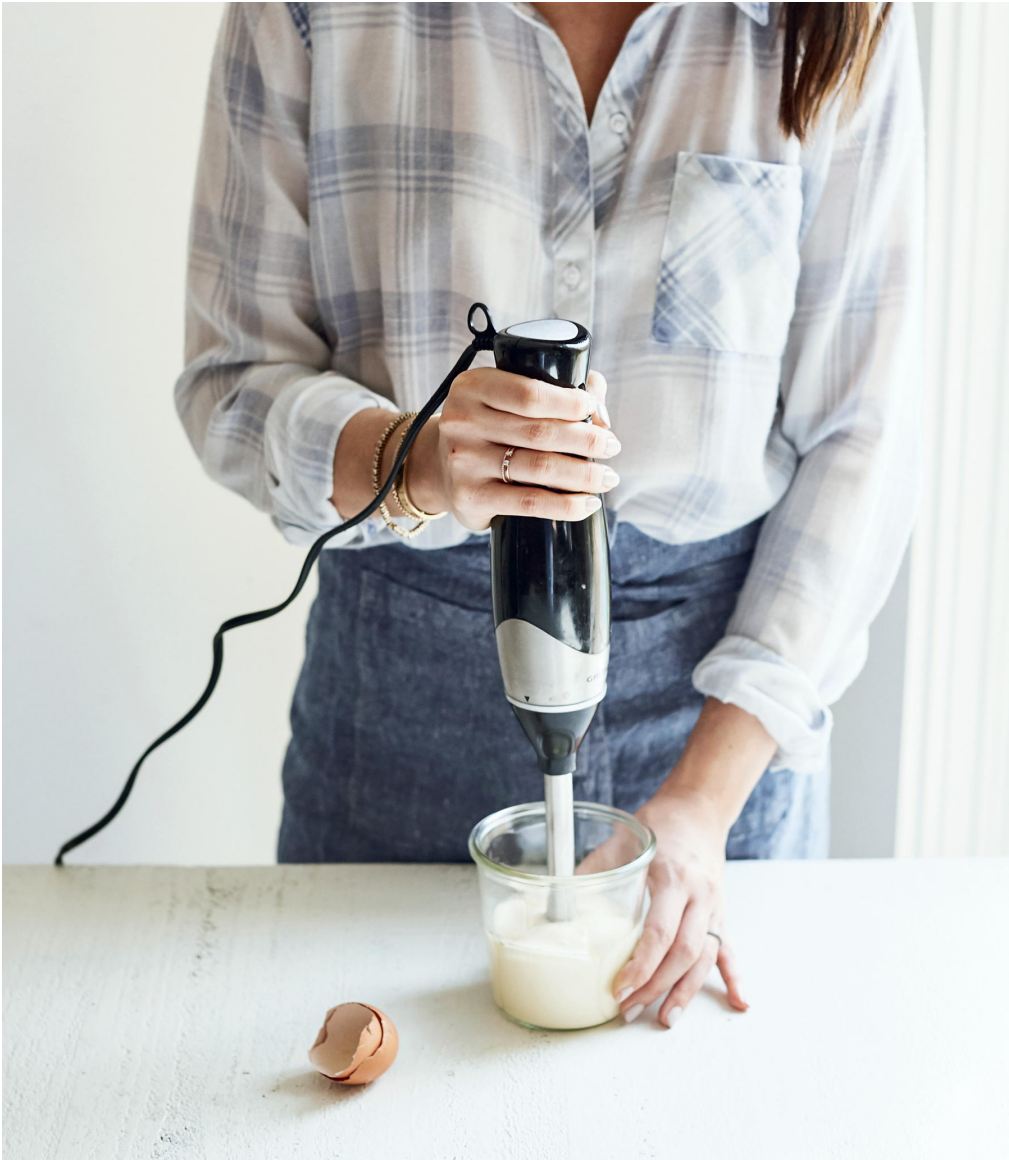
One-Minute Immersion Blender Mayo Base