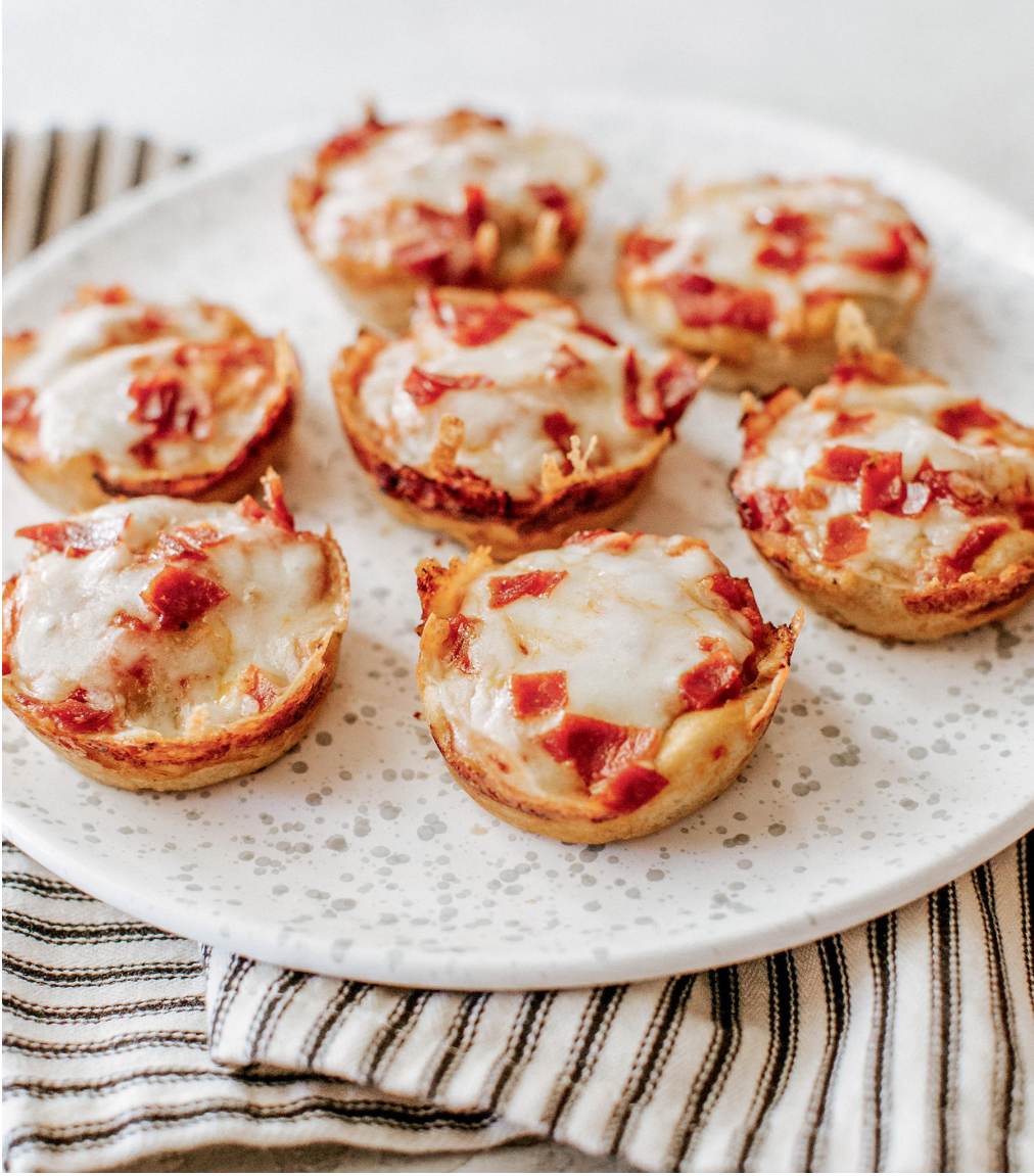
Grain-Free Pizza Bites