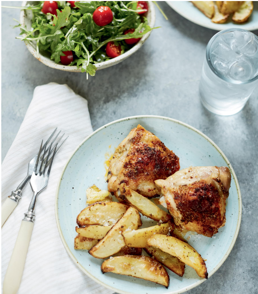
Lemony Greek Potatoes with Crispy Greek Chicken Thighs