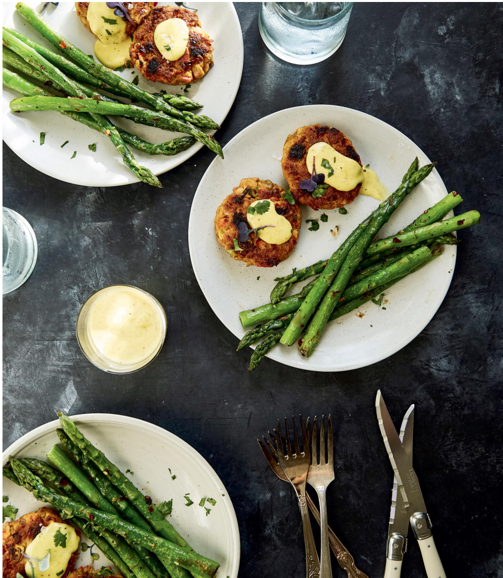
Curried Tuna Cakes with Lemony Asparagus