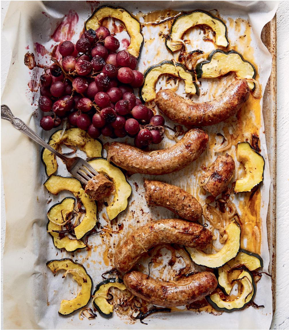
Sheet Pan Sausage with Squash and Roasted Grapes