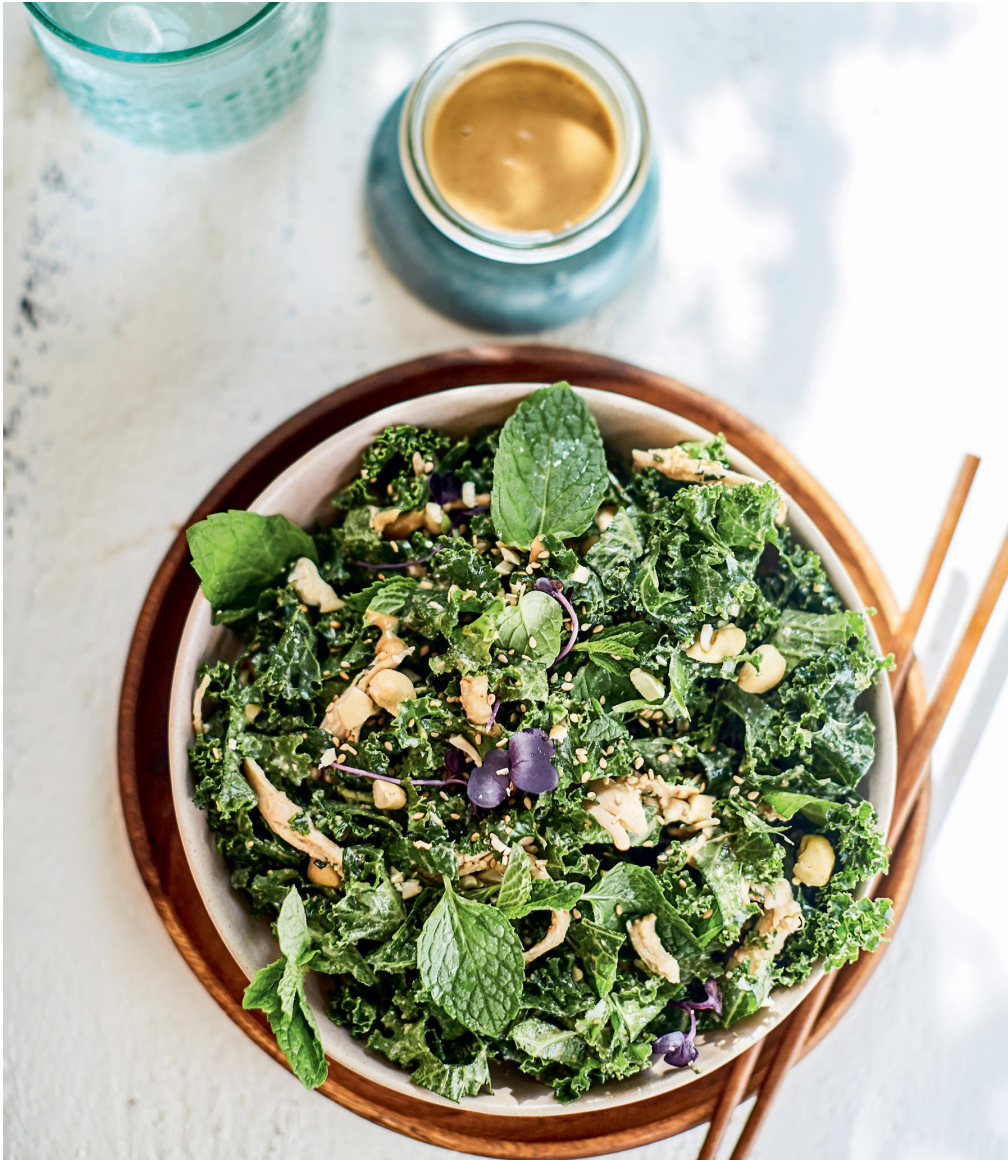
Kale and Mint Salad with "Peanut" Vinaigrette