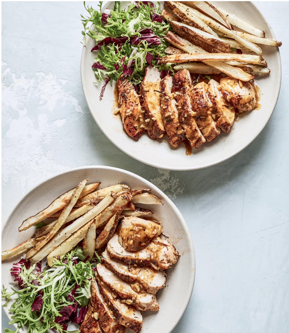
Pan-Roasted Blackened Cajun Chicken with Oven Frites