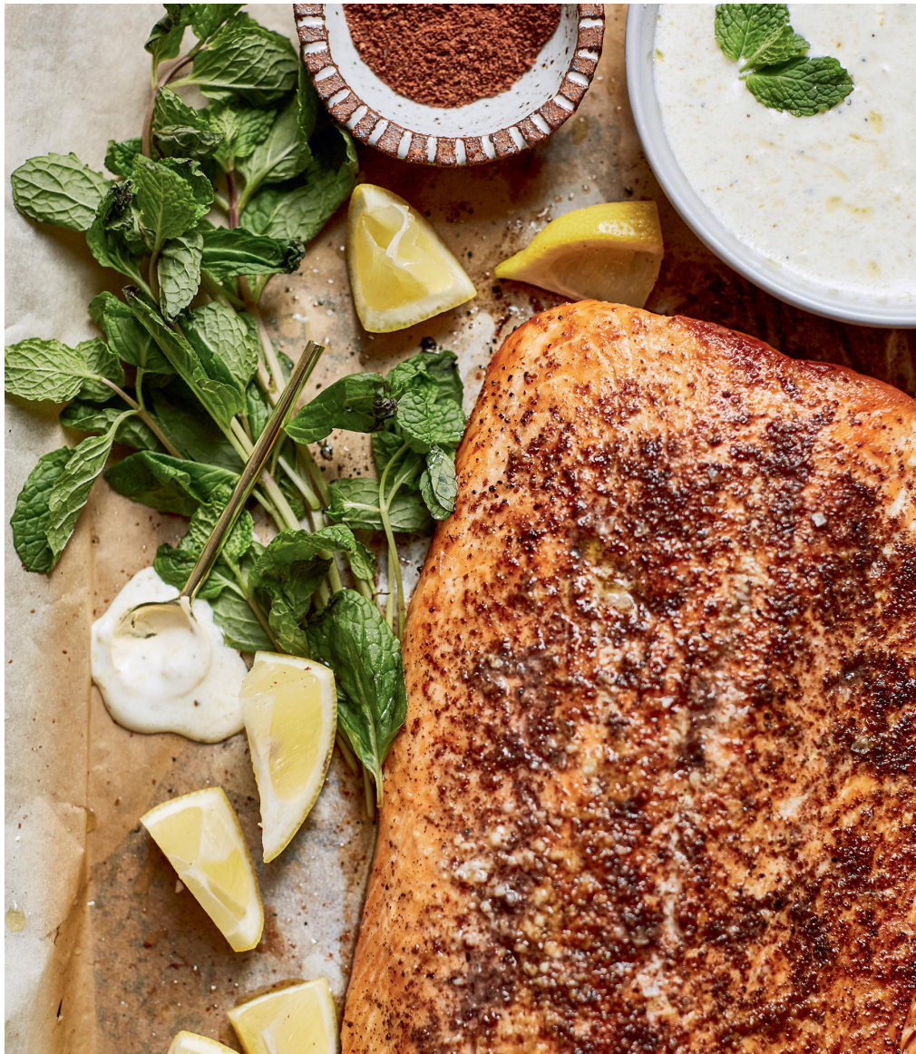
Sumac-Roasted Salmon with Mint-Coriander Yogurt Sauce