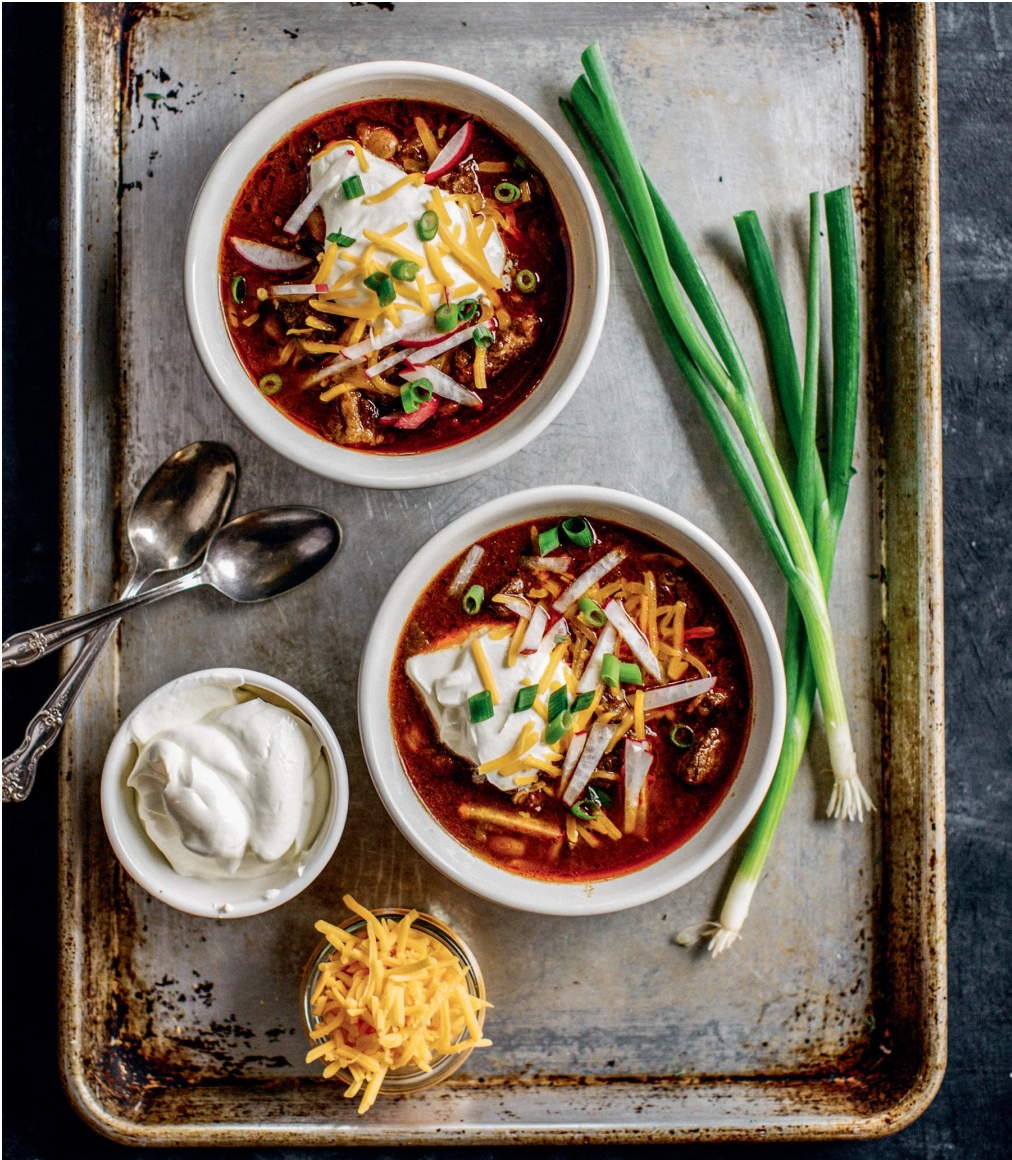
Texas Brisket Chili