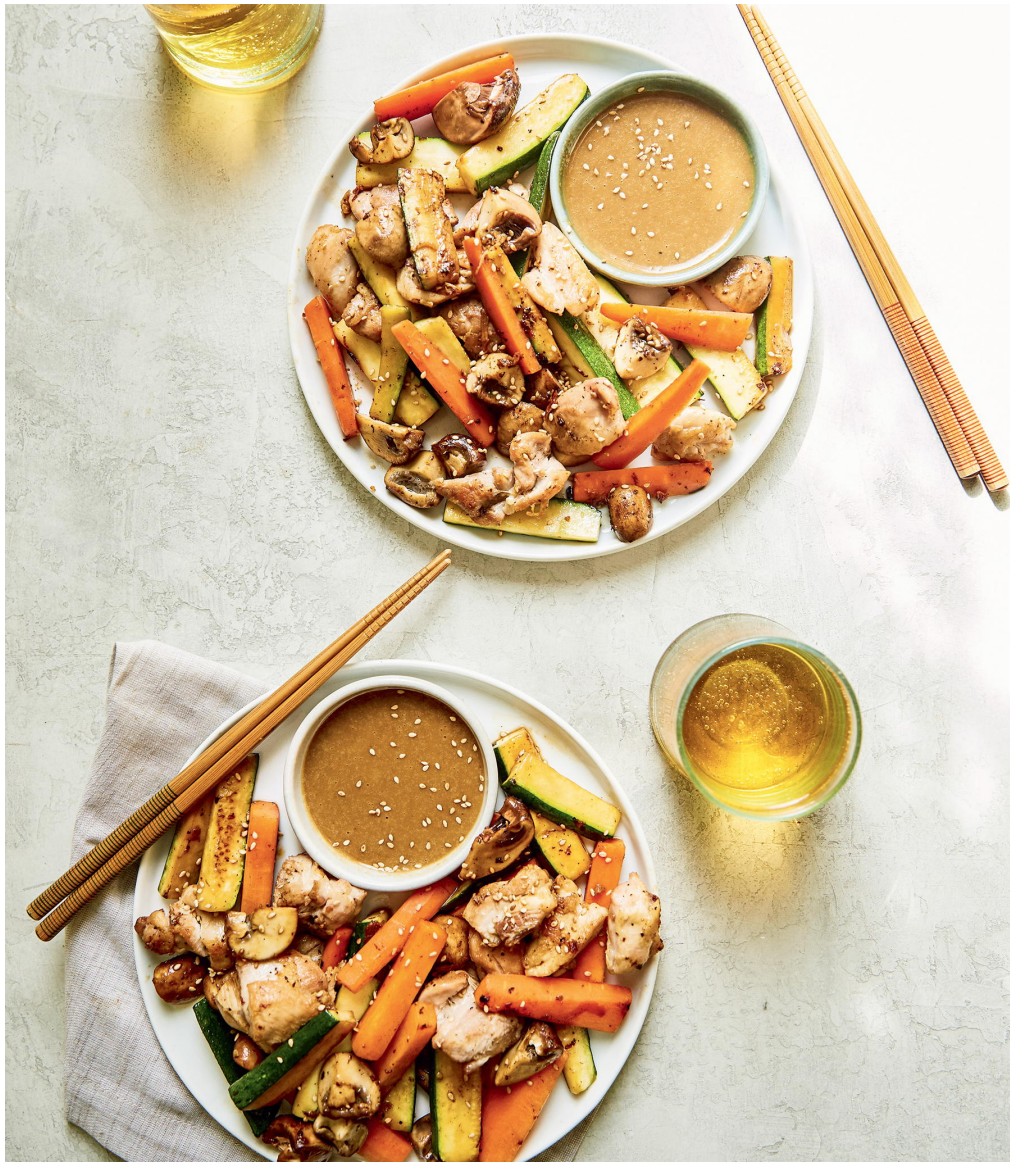
Hibachi-Style Chicken with Magic Mustard Sauce