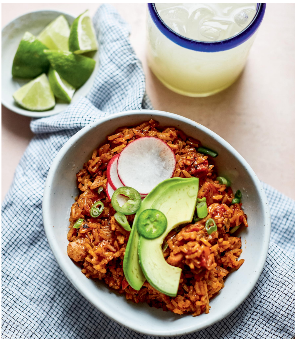
One-Pan Mexican Chicken and Rice