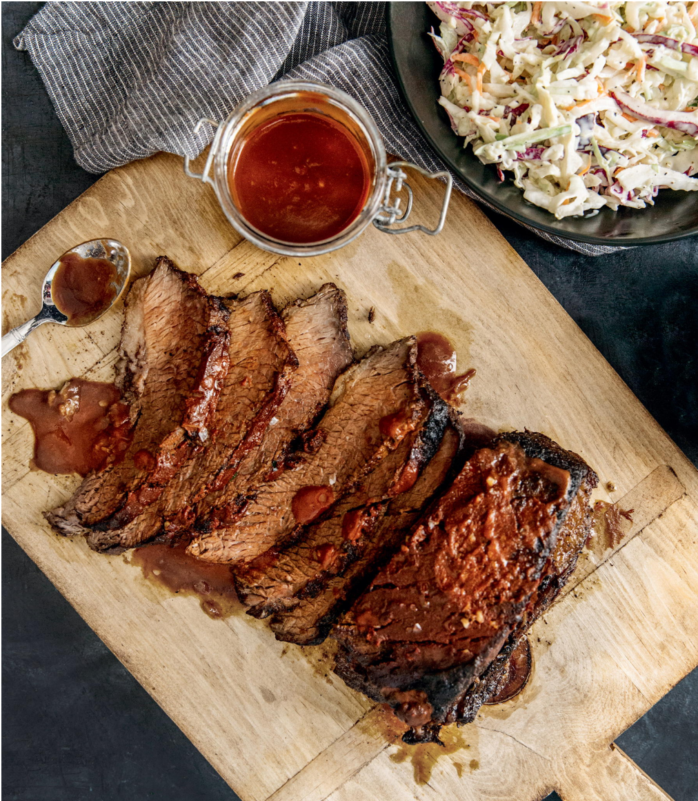
Slow-Cooker BBQ Beef Brisket with Quick-and-Easy Coleslaw