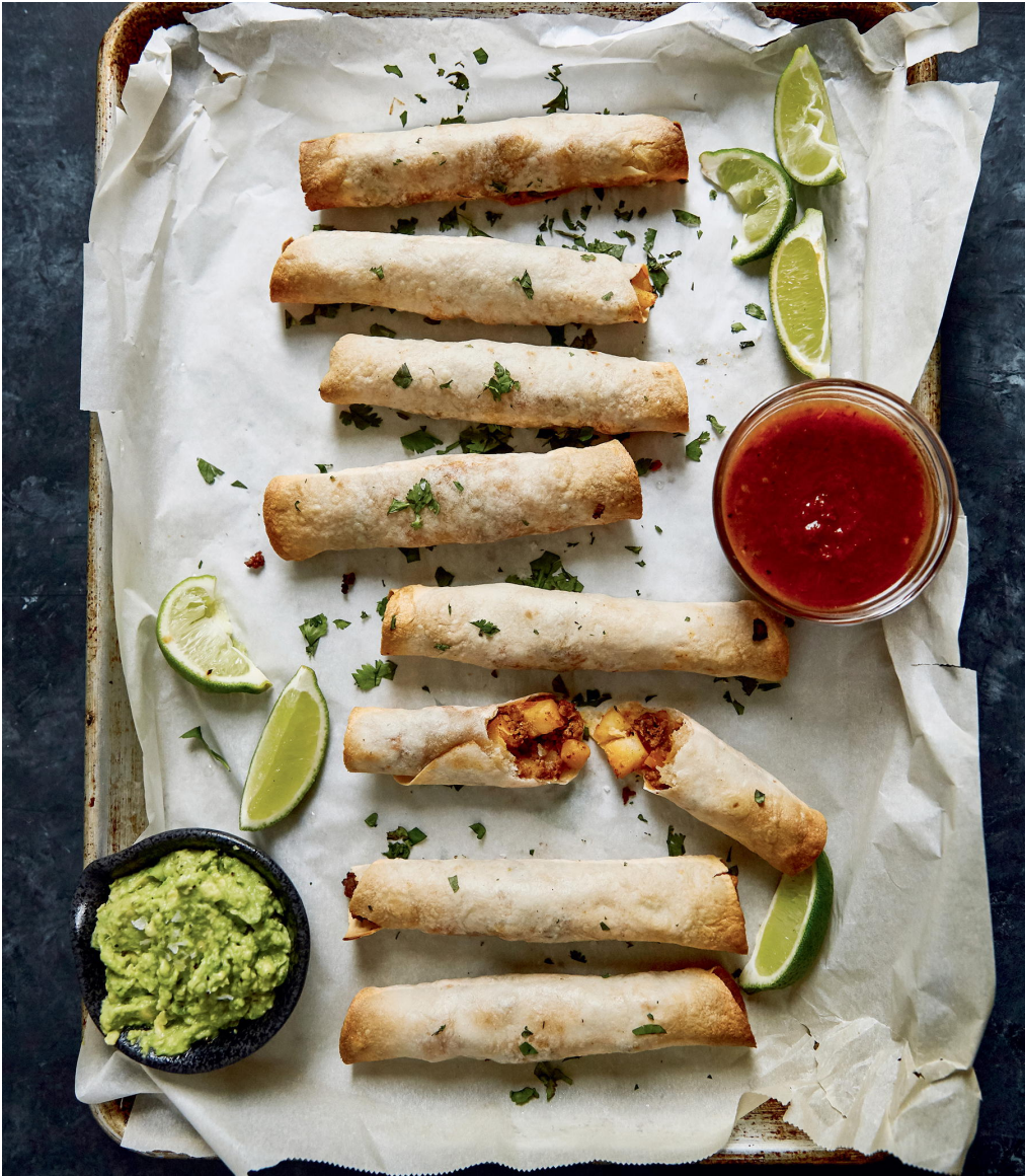
Chorizo con Papas Taquitos