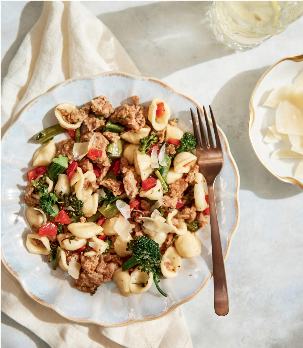
Orecchiette Pasta with Sausage, Broccolini, and Roasted Red Peppers