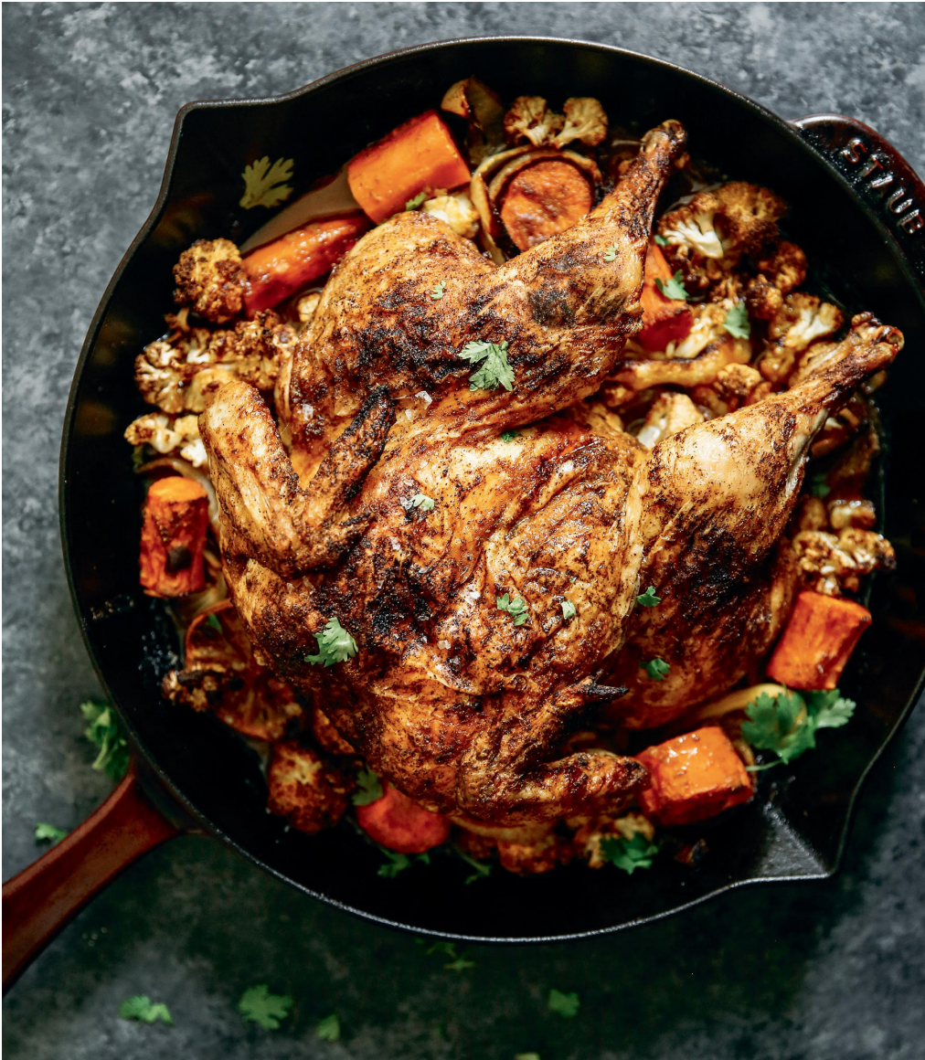
Indian Skillet-Roasted Chicken