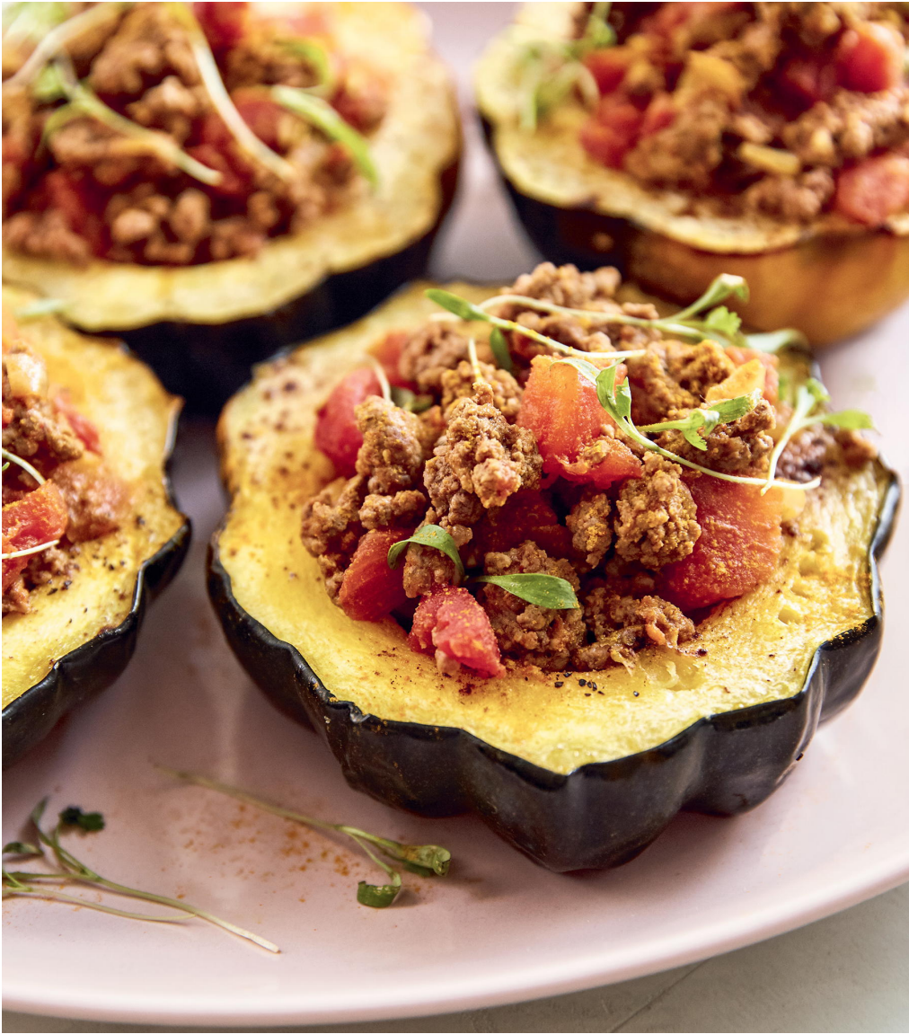
Curried Beef-Stuffed Acorn Squash