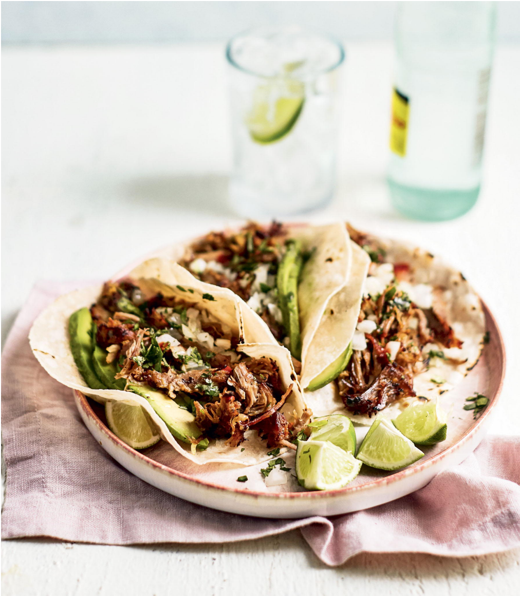
Crispy Slow Cooker Carnitas