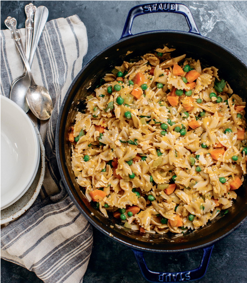
One-Pot Chicken Pot Pie Pasta