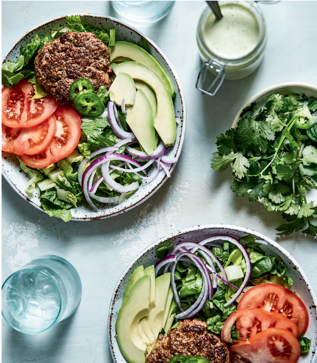
Hamburger Salad with Creamy Jalapeño Dressing