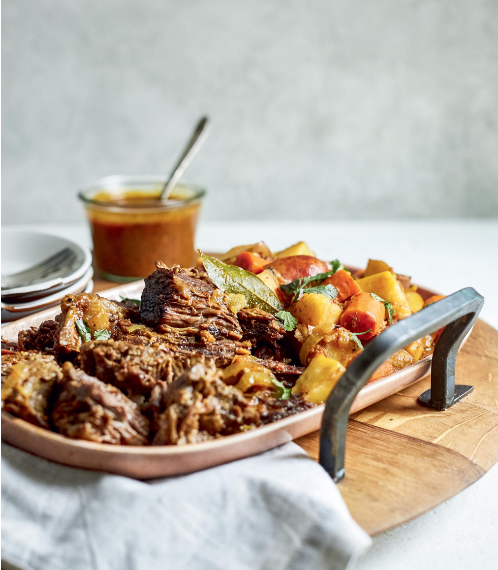
Curried Pot Roast