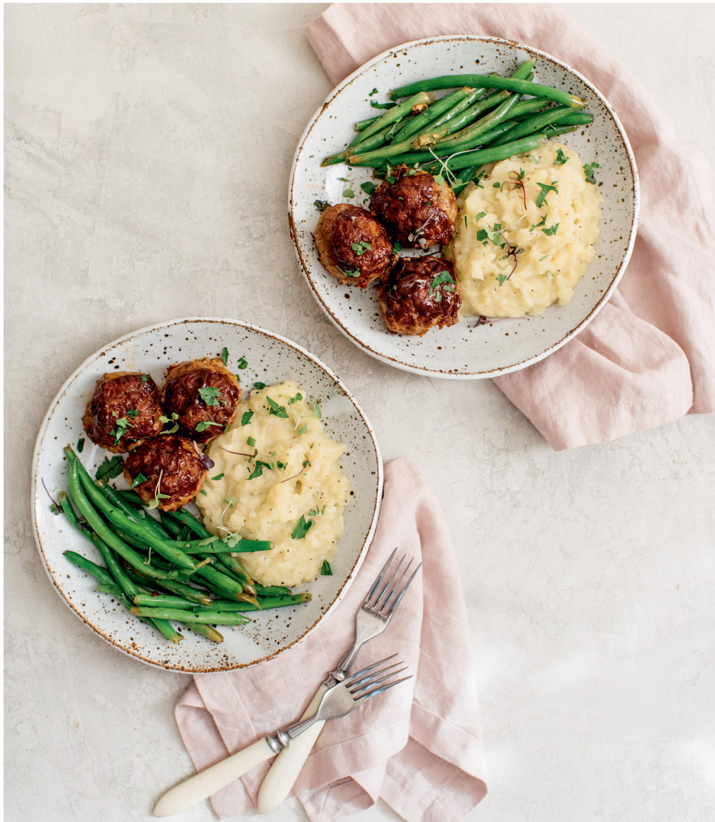
Meatloaf Meatballs with Mashed Potatoes and Green Beans