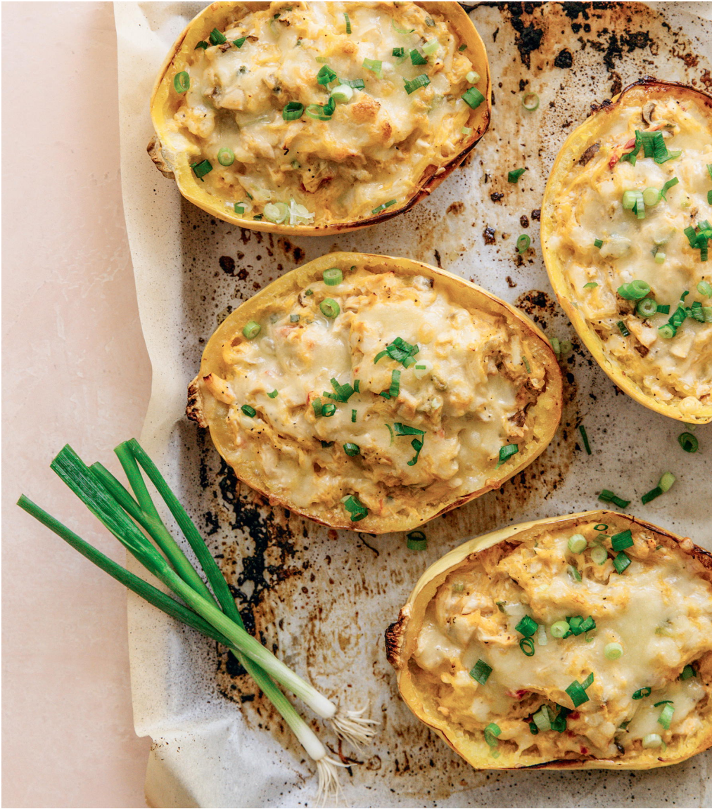
Chicken Spaghetti Squash Boats