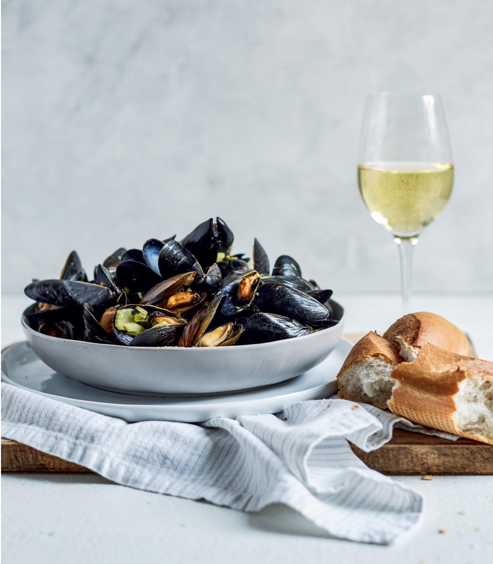
Mussels with Saffron and Fennel Broth