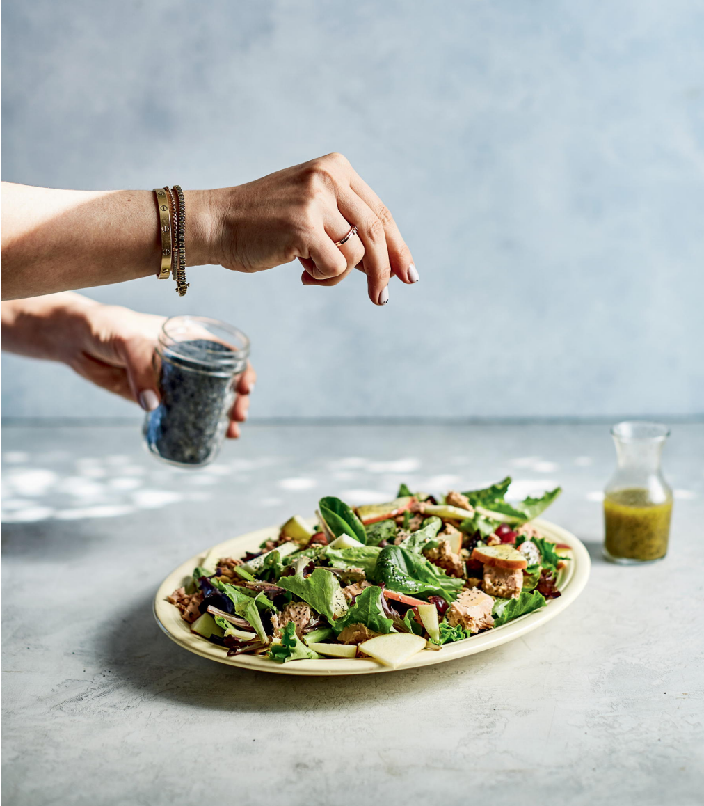
Simple Waldorf Tuna Salad