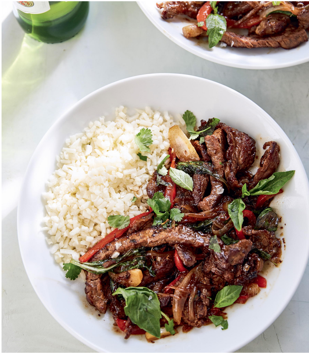
Thai Basil Beef