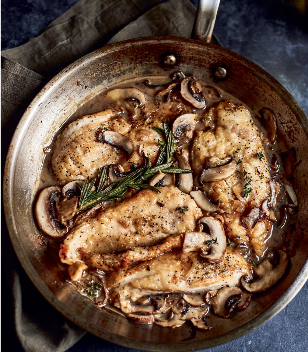
Skillet Chicken with White Wine, Herbs, and Roasted Broccolini