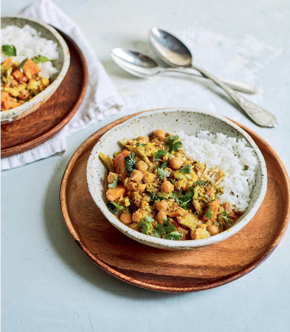
Indian-Style Vegetable Curry.