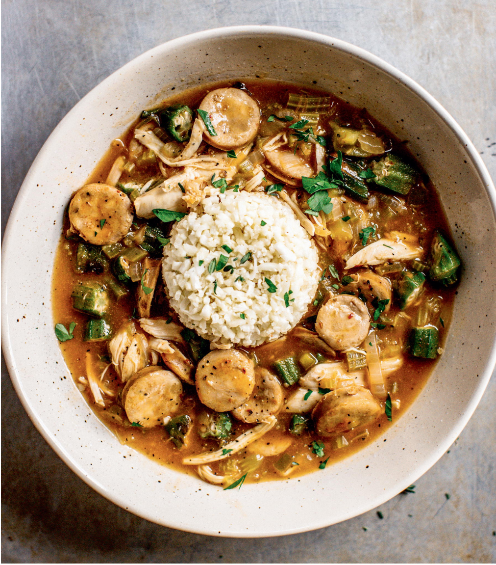
Chicken and Sausage Gumbo