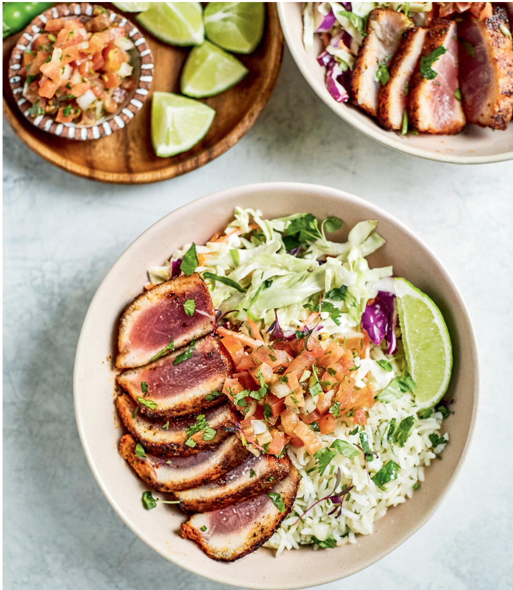
Blackened Tuna Bowls with Chili-Lime Slaw and Cilantro-Lime Rice