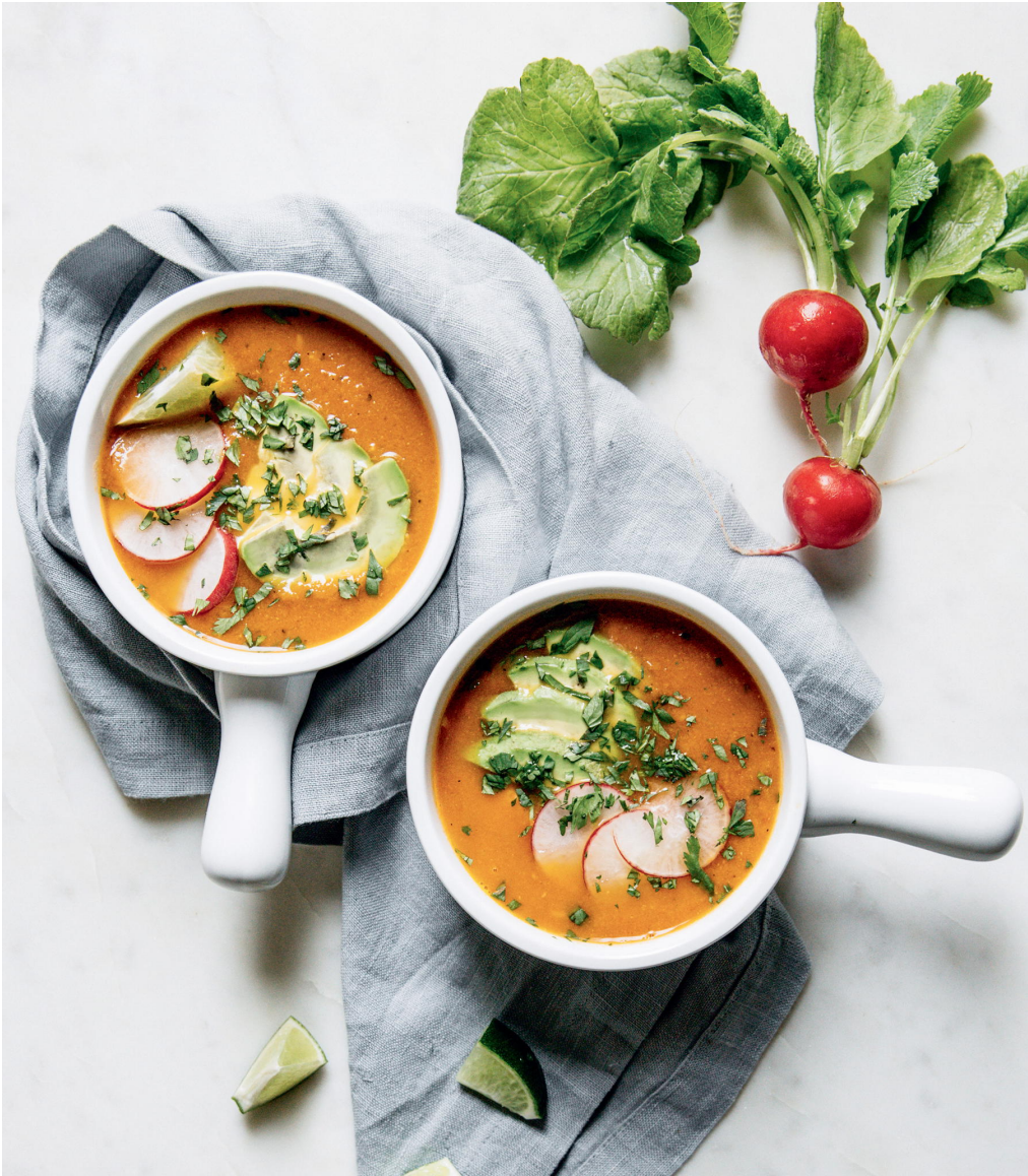
Creamy Tortilla-less Soup