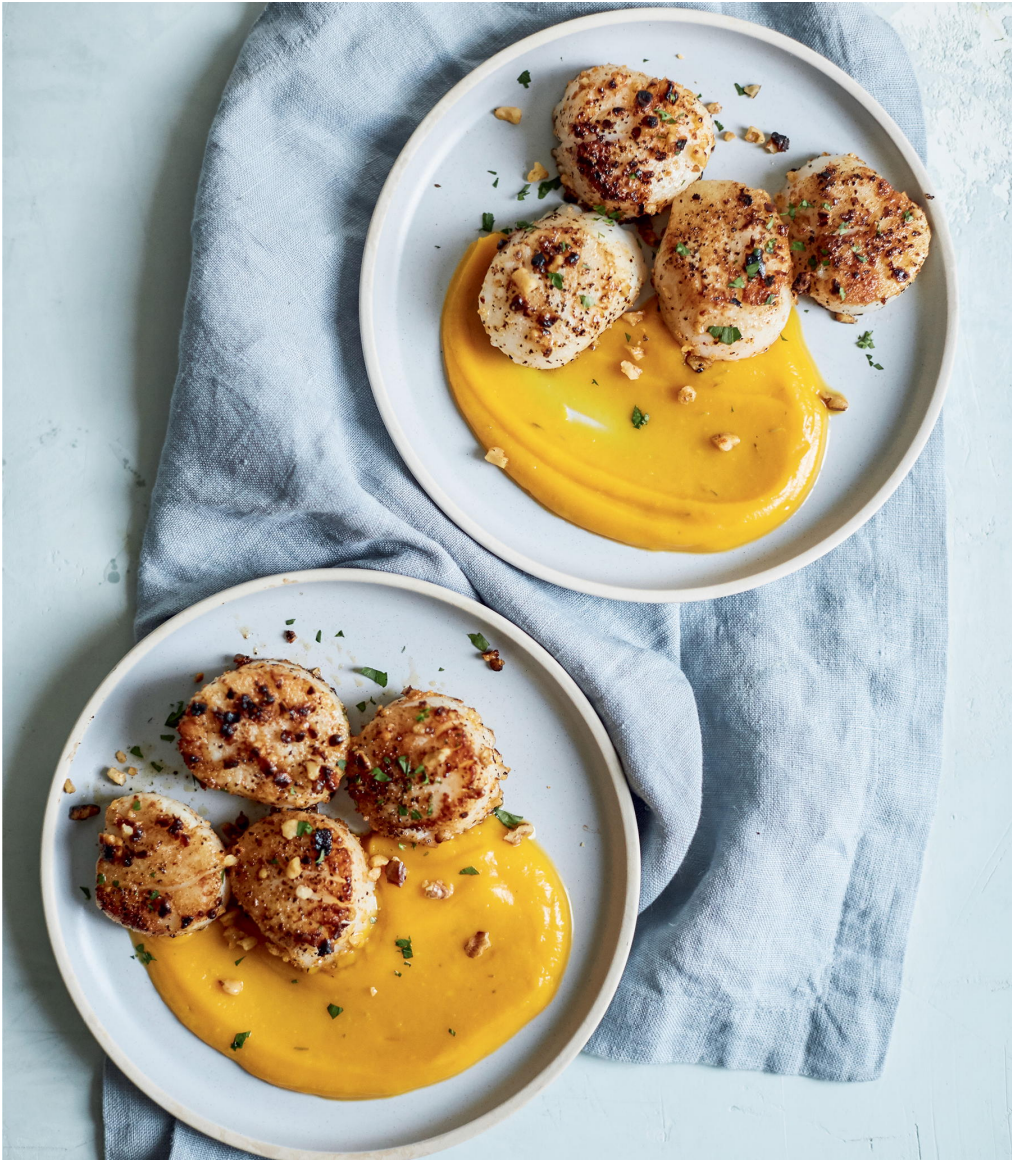
Walnut-Crusted Scallops with Butternut Squash Puree