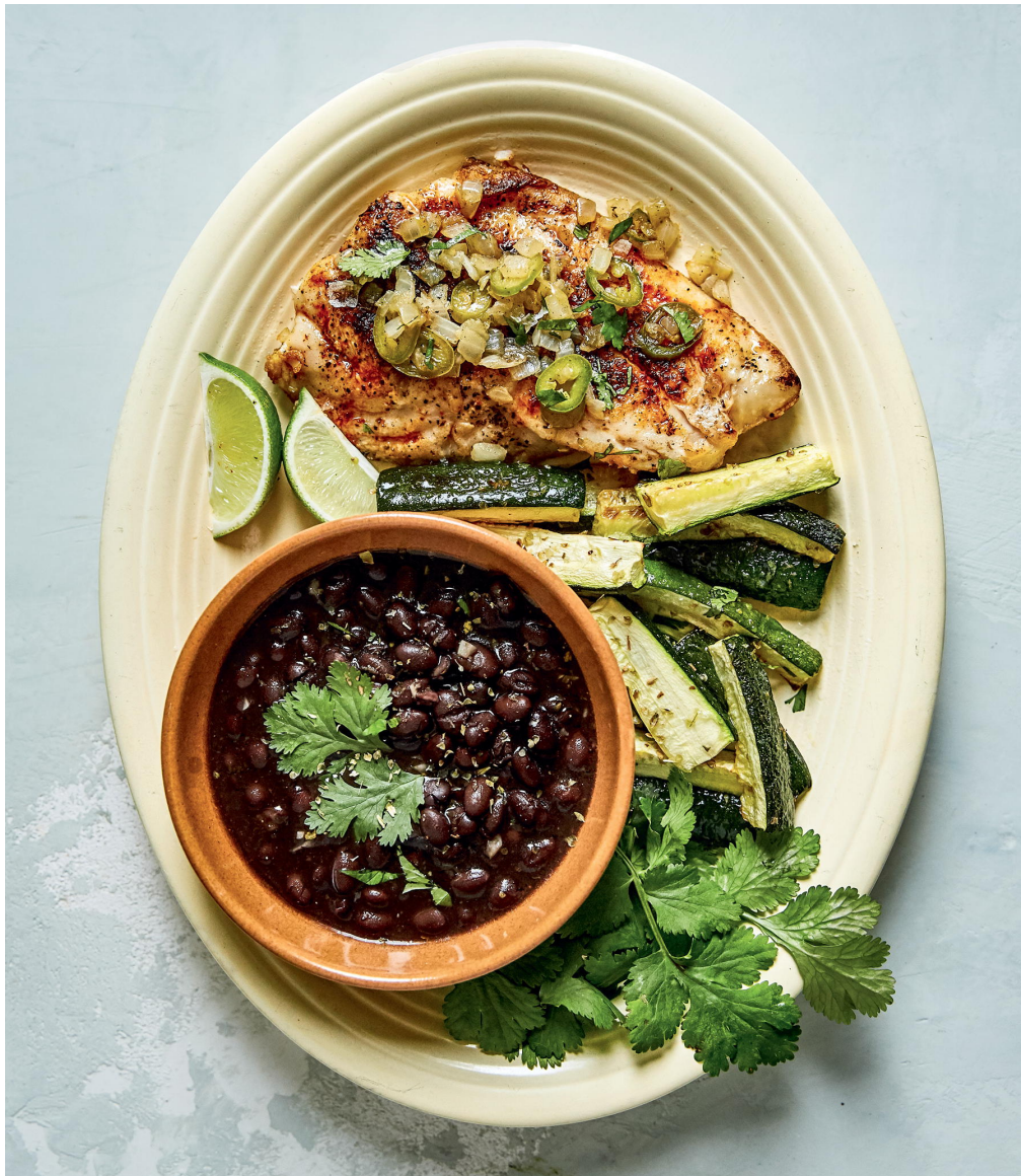
Spicy Red Snapper Platter with Roasted Zucchini and Black Beans