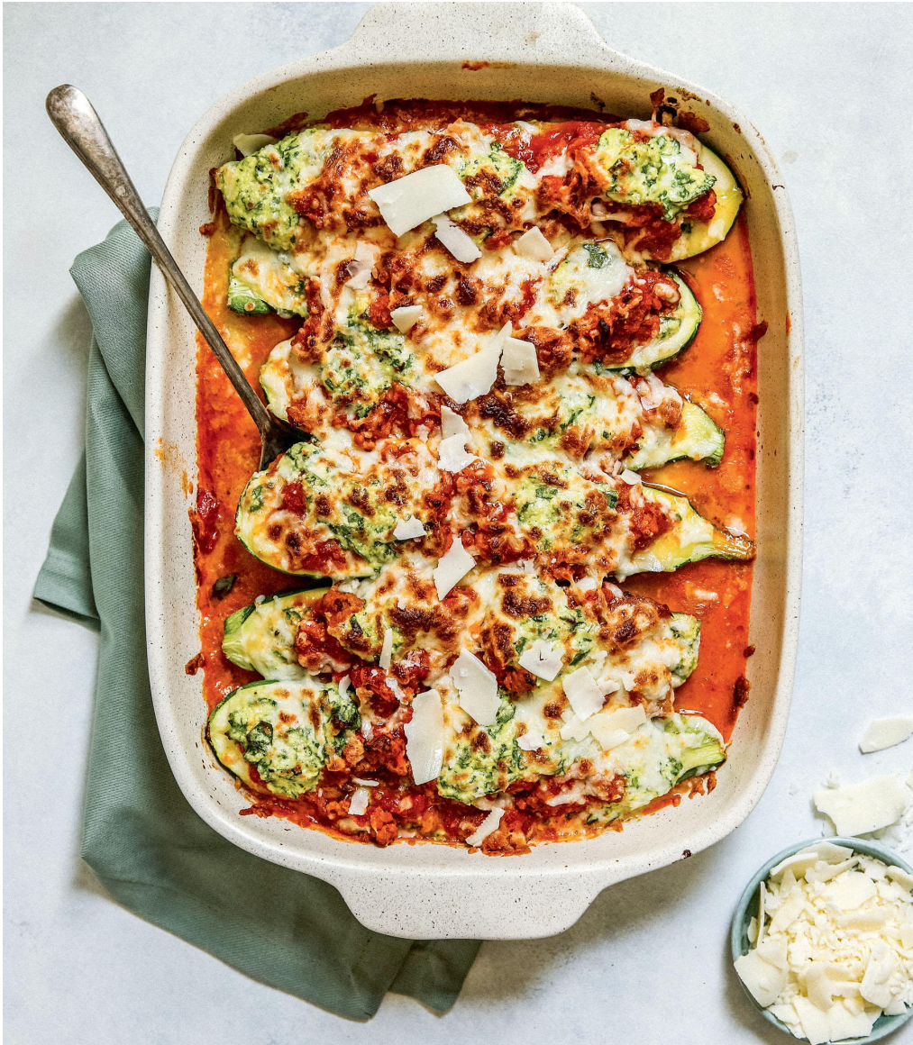
Lasagna-Stuffed Zucchini Boats