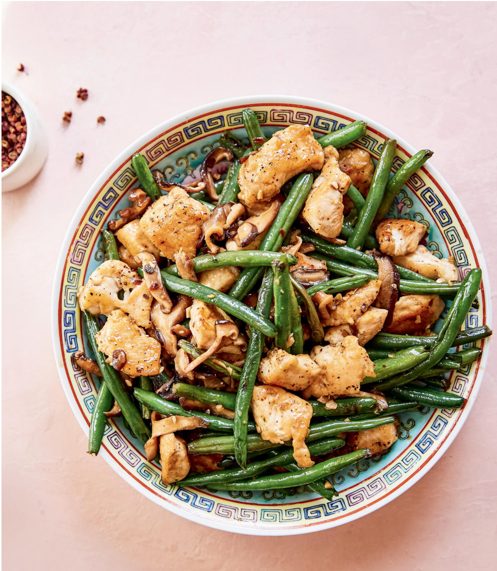
Sichuan Chicken with String Beans