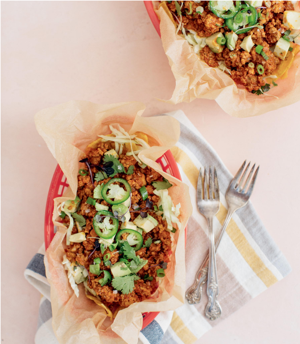
Paleo Chili Pie