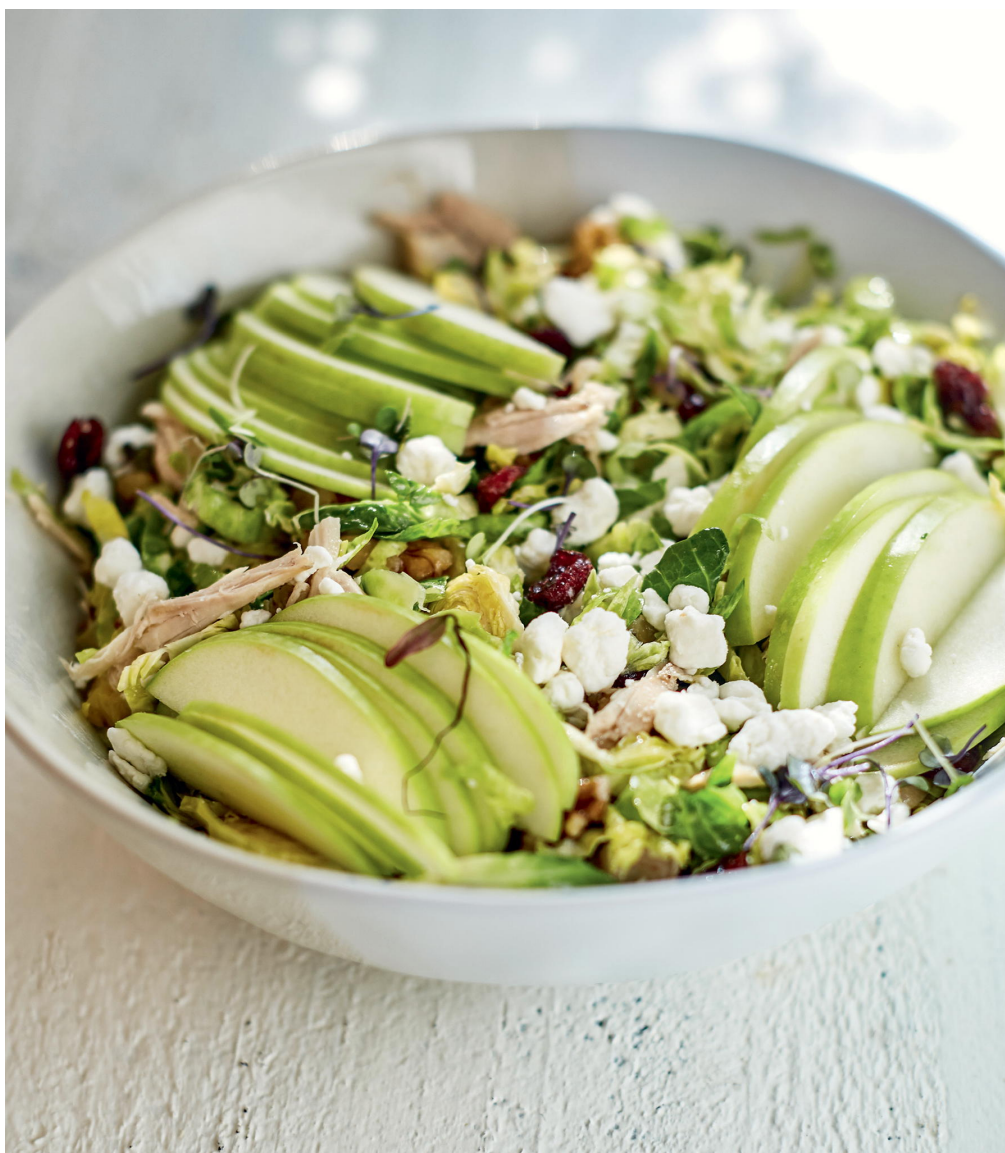
Brussels Sprout Salad with Honey-Mustard Vinaigrette