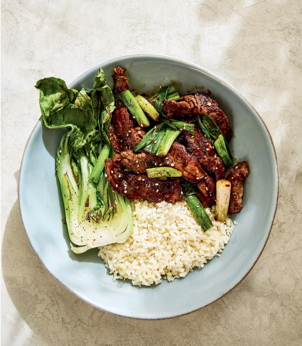
Mongolian Beef Stir-Fry