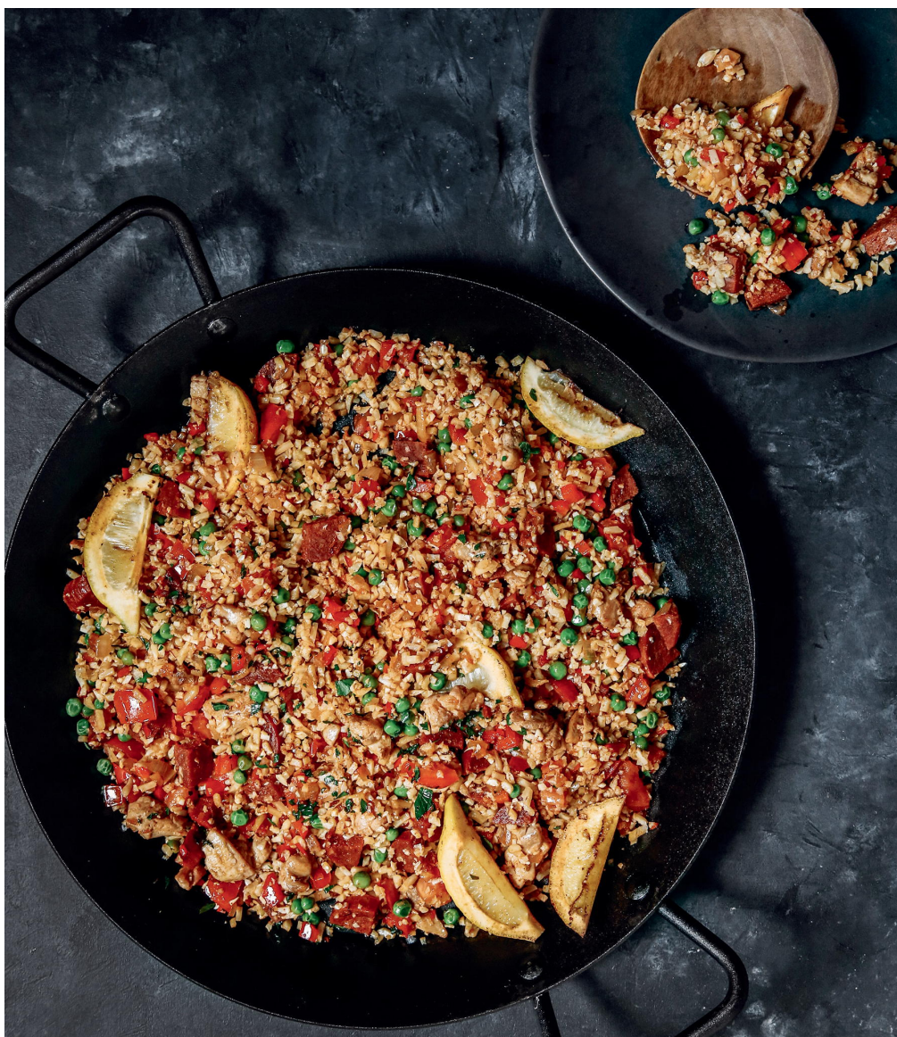
Chorizo and Chicken Paella