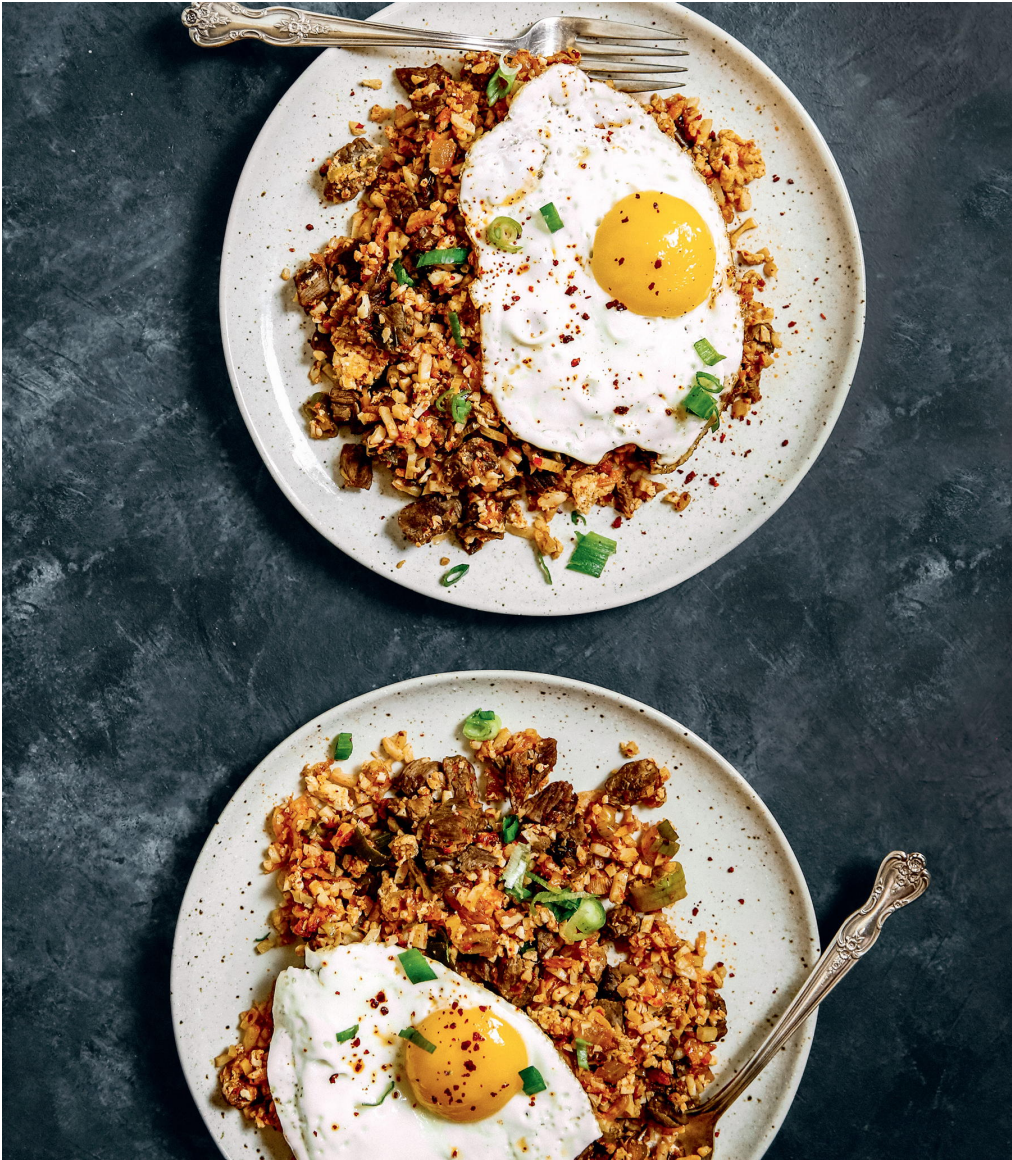
Korean Kimchi Fried Cauli Rice