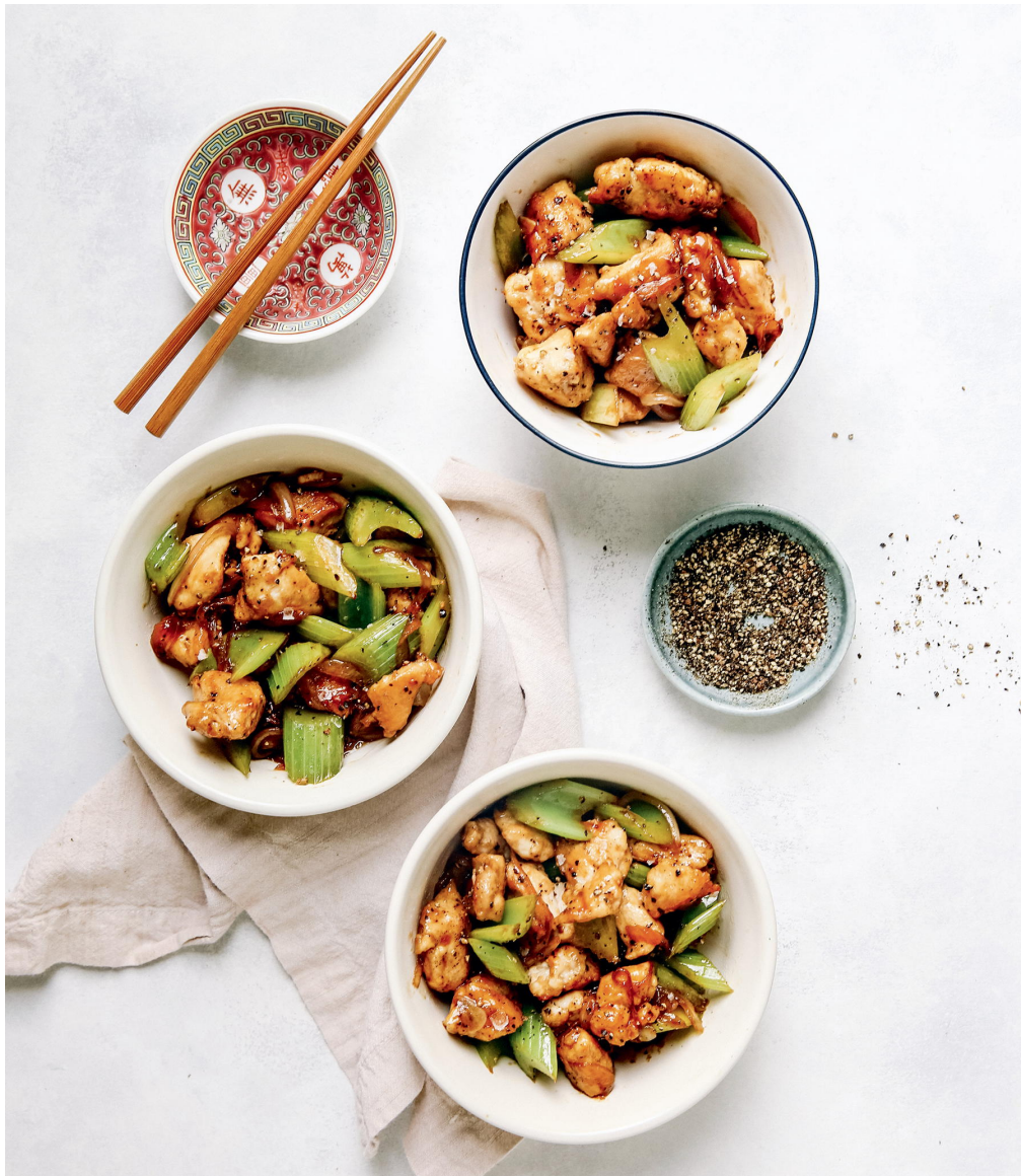
Black Pepper Chicken