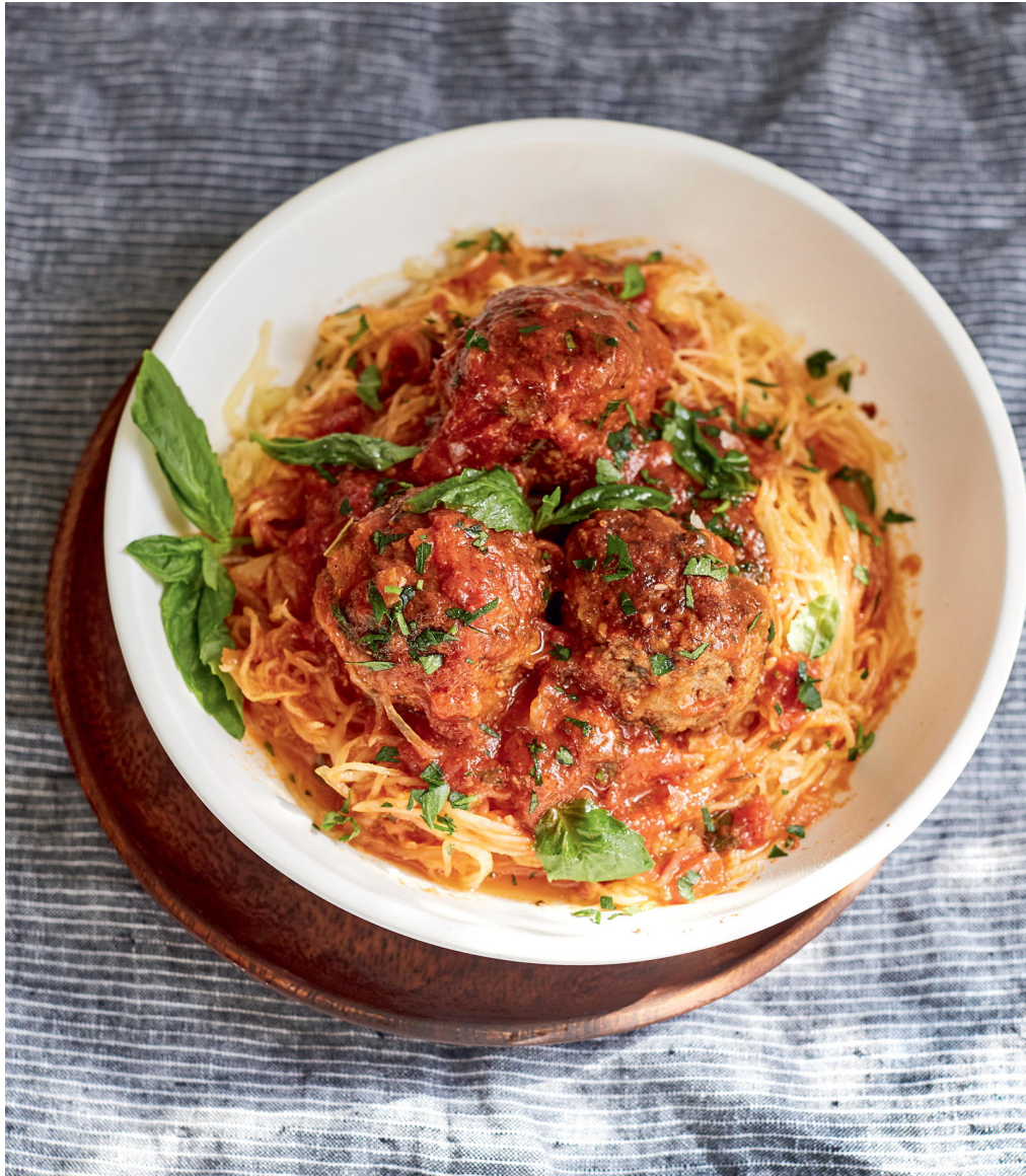
Perfect Whole30 Italian Meatballs in Marinara Sauce