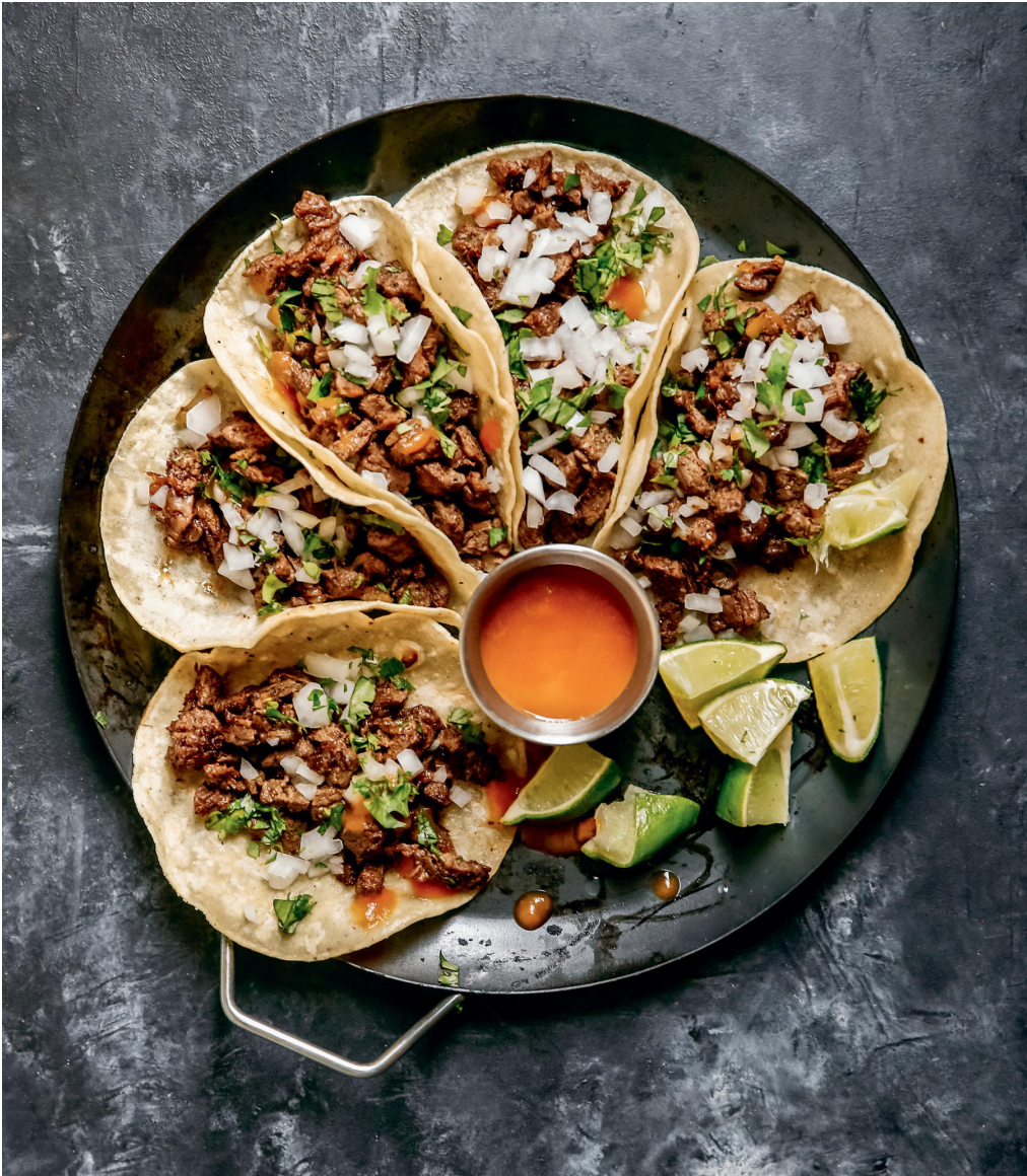
Steak Street Tacos