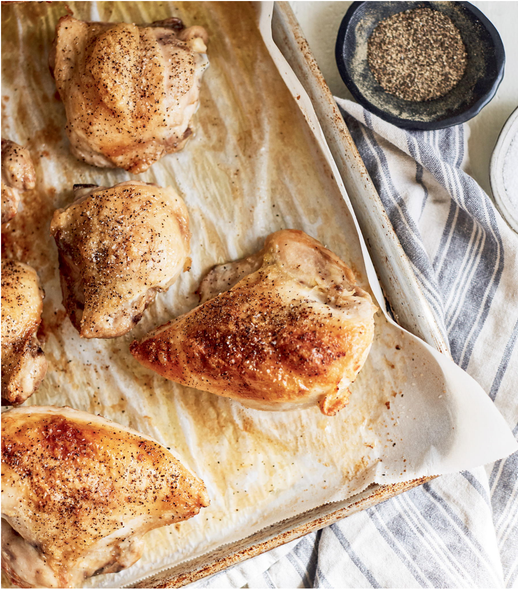
Simple Roasted Chicken