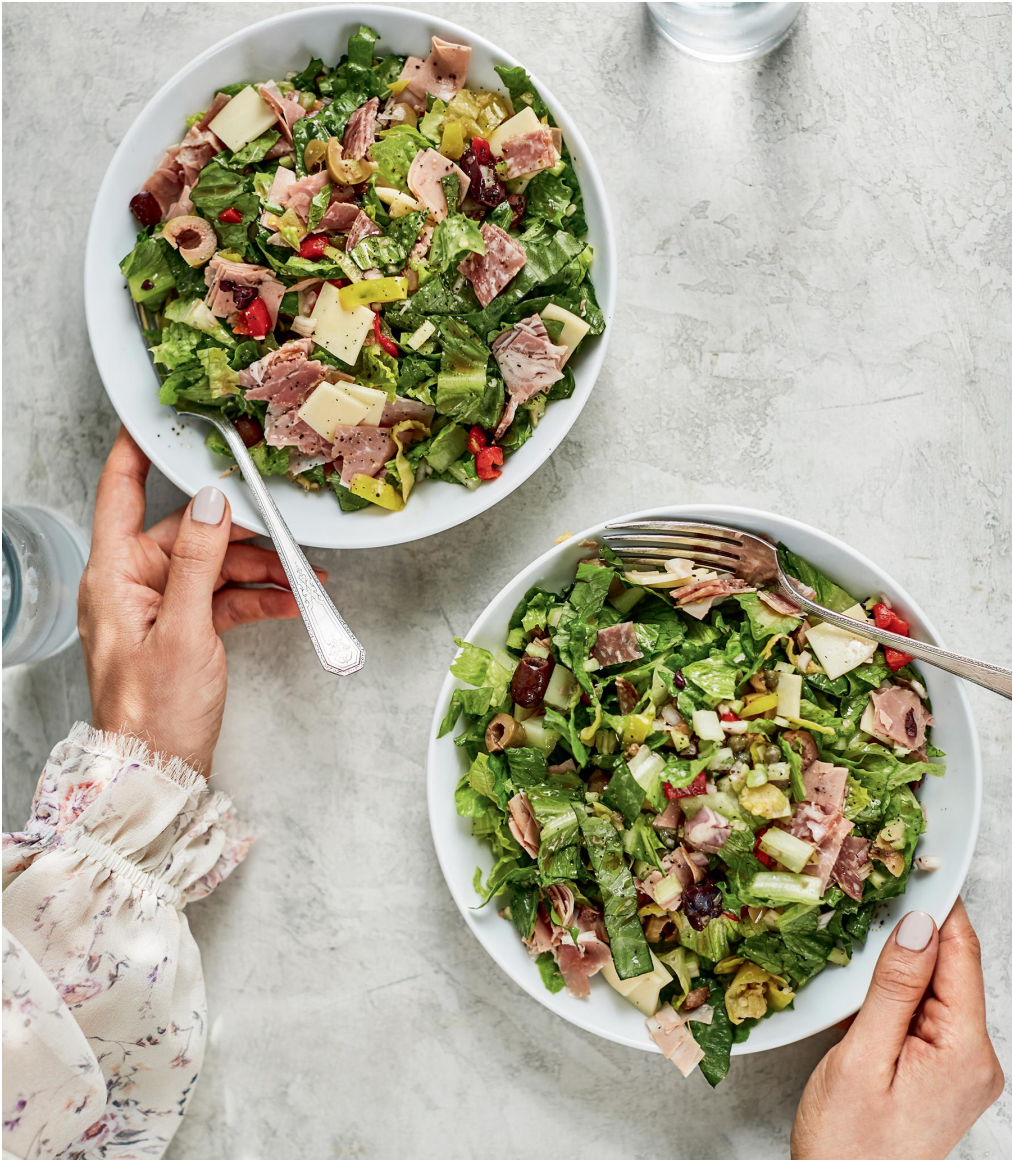
Chopped Muffuletta Salad