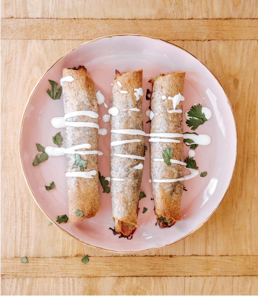
Sour Cream Chicken Taquitos