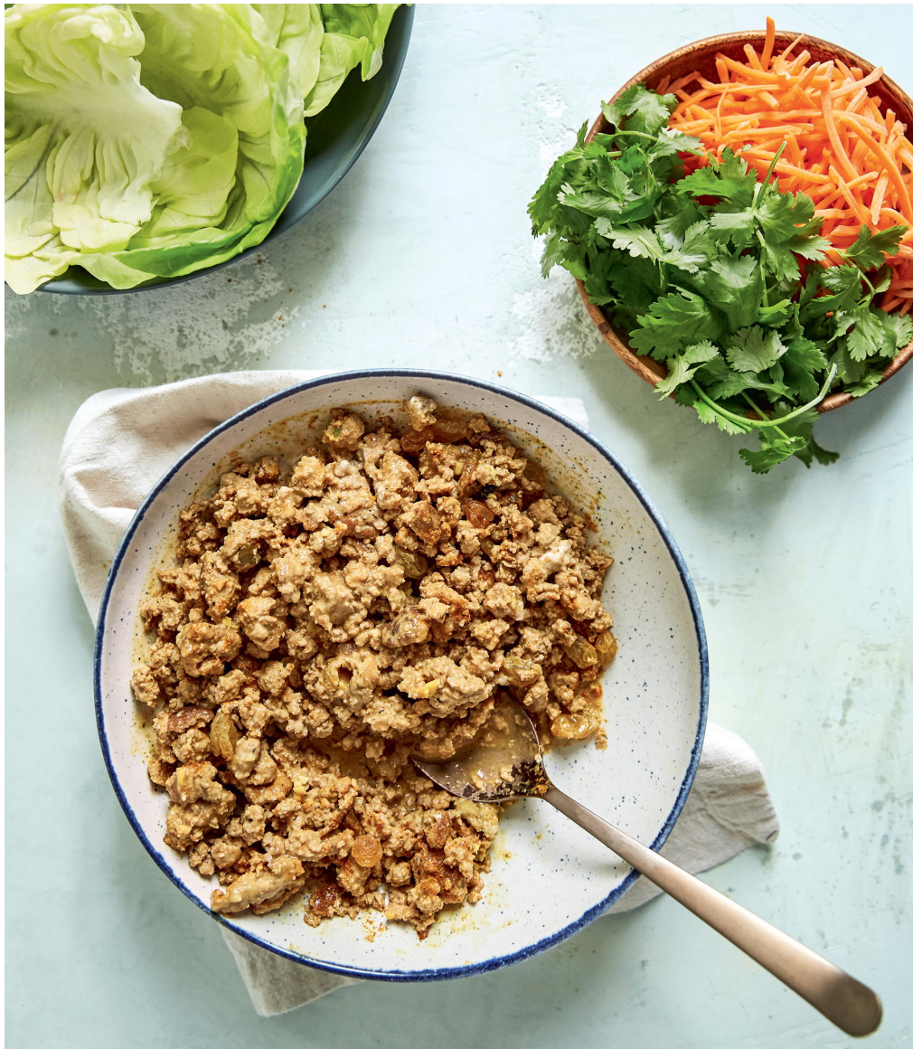
Easy Ground Turkey Curry Lettuce Cups