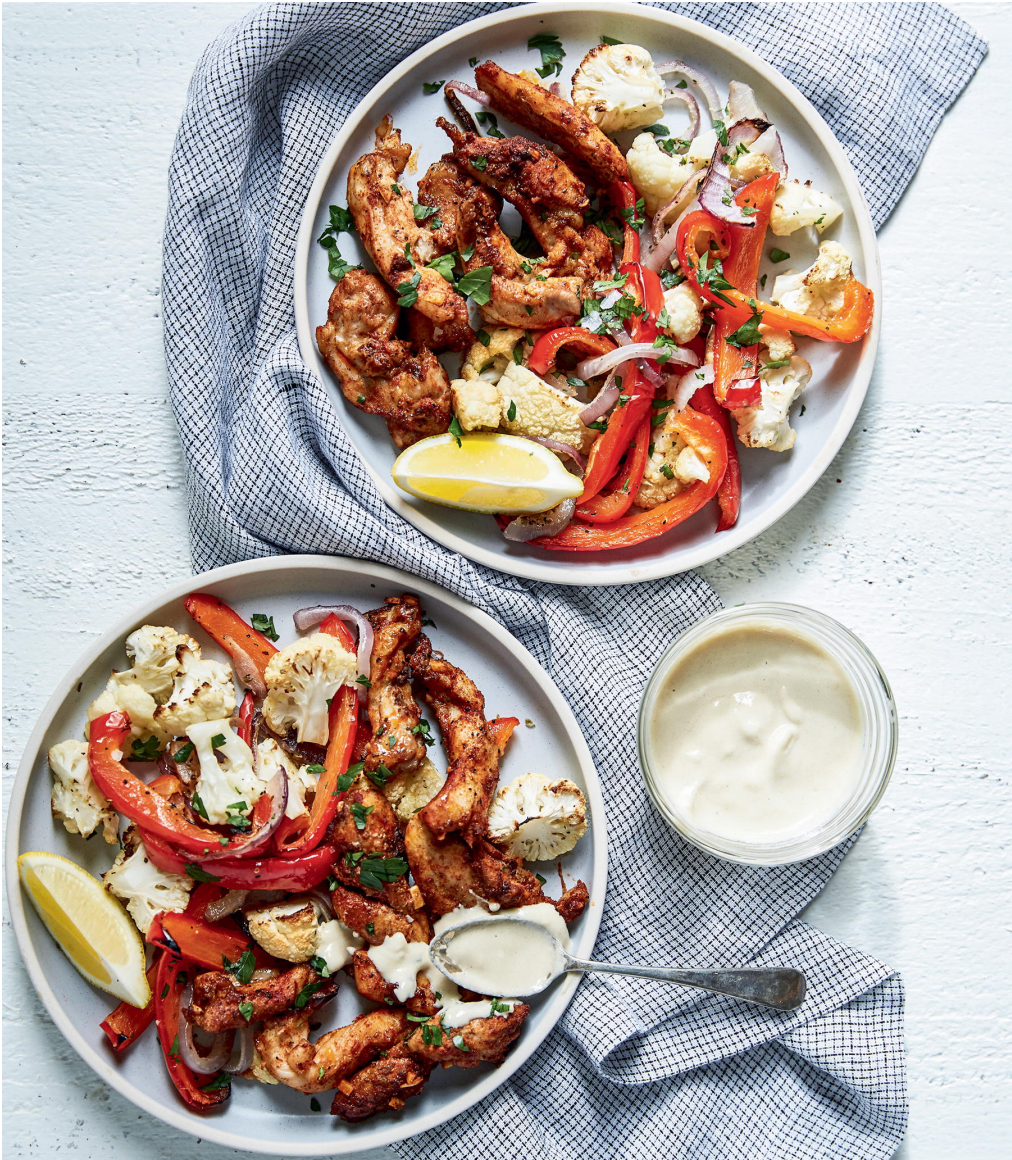
Sheet-Pan Chicken Shawarma with Lemon-Tahini Drizzle