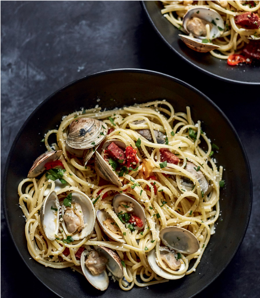
Linguine with Clams, Chiles, and Salami