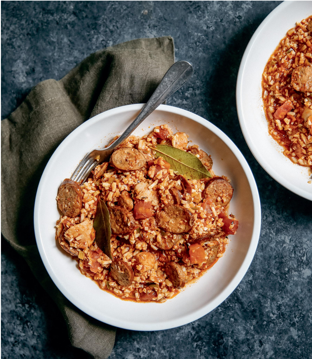
Easy Skillet Cauliflower Rice Jambalaya with Chicken and Sausage