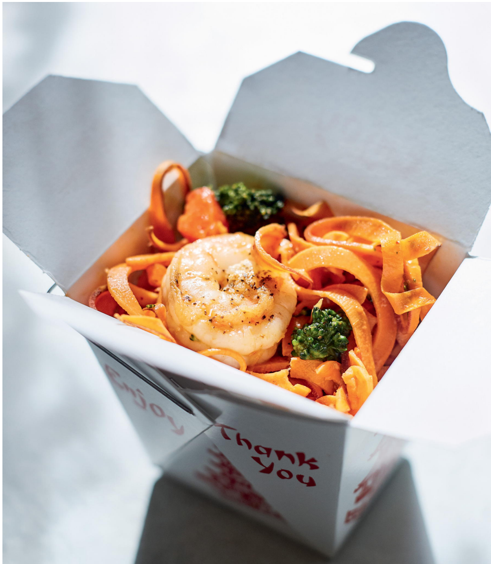
Red Curry Shrimp and Sweet Potato Noodle Stir-Fry.