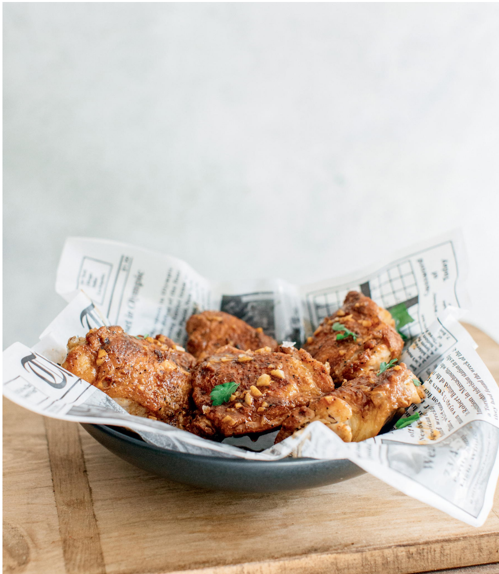
Nashville Un-Fried Hot Chicken with Easy Collard Greens