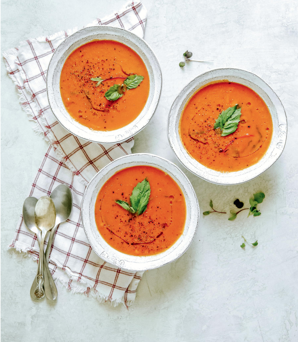
Creamy Tomato Basil Soup